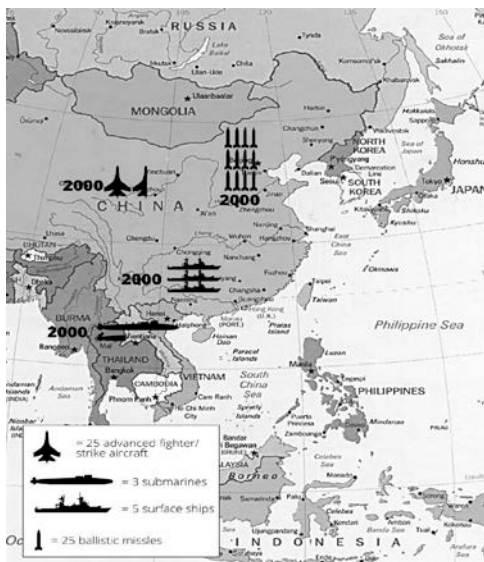
Figure 1: PLA military capabilities 2000