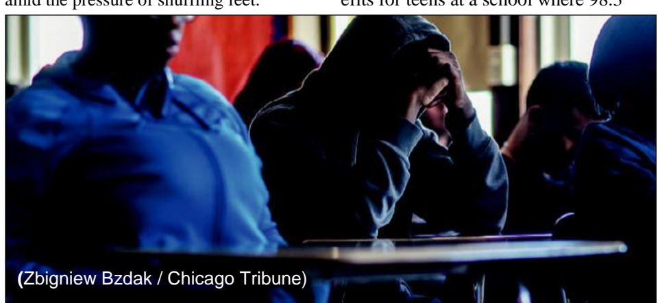
Students at Gage Park High in Chicago participate in Quiet Time last month. The meditation program is run by the David Lynch Foundation.

Researchers are examining whether the meditation program offers tangible benefits for teens at a school where 98.3