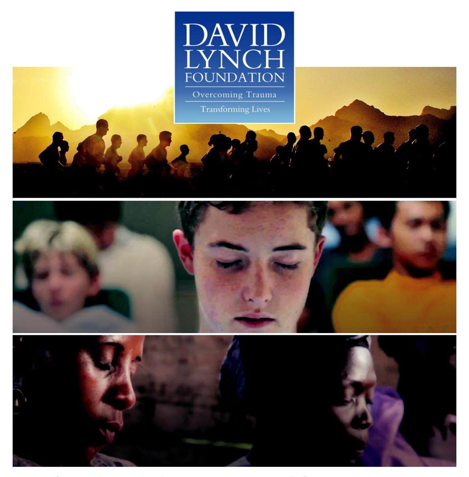
Core Programs | Research Review | Chicago Tribune