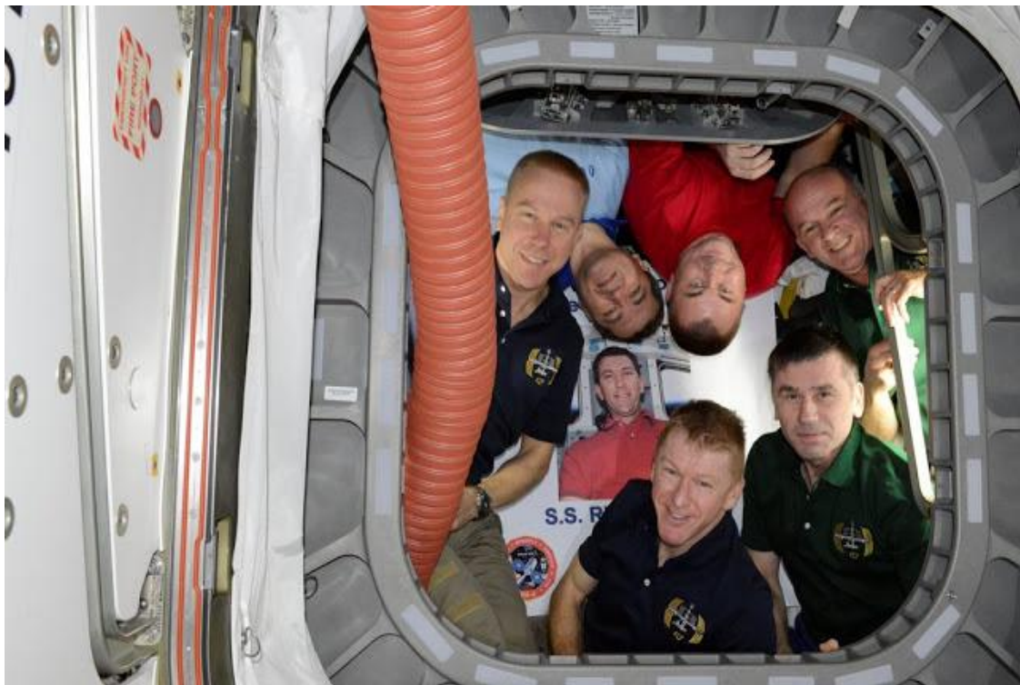
Figure 3: Human Rated Cygnus with the Space Station Crew inside