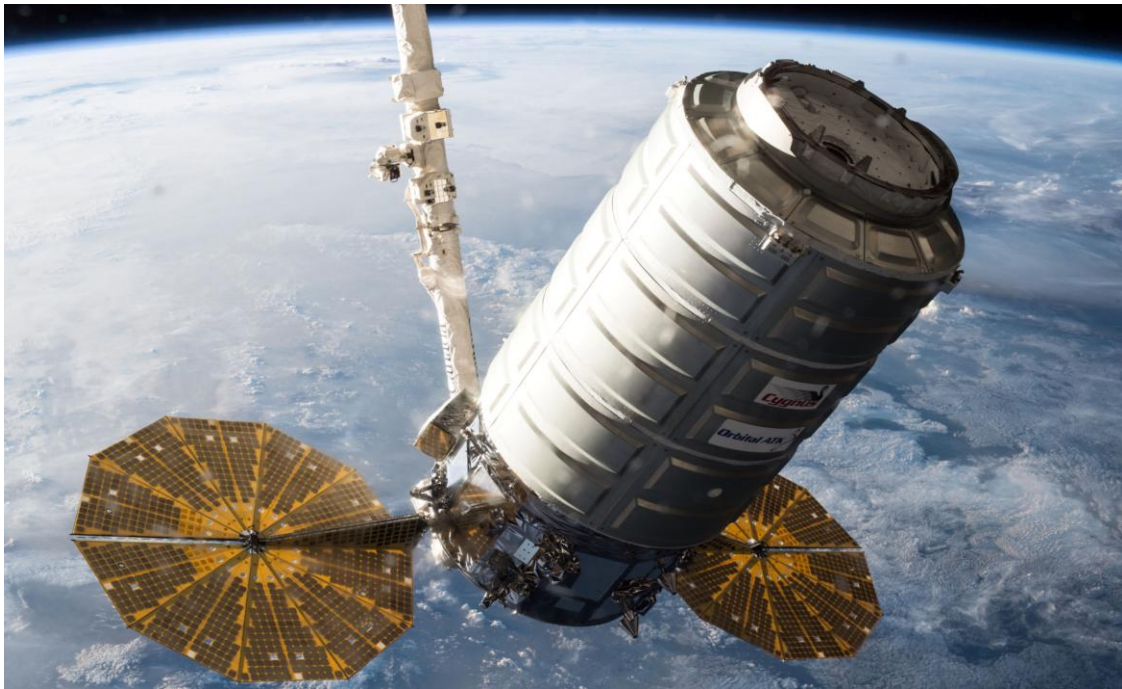
Figure 2: Cygnus Cargo Vehicle