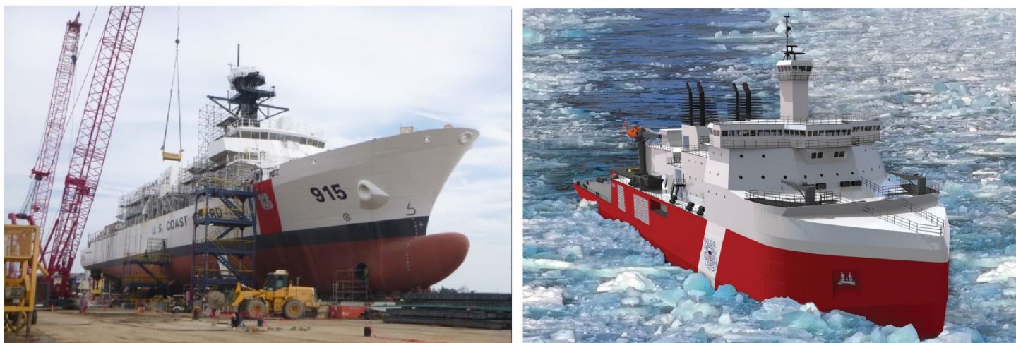
Figure 1: The Coast Guard's Offshore Patrol Cutter and Polar Security Cutter

GAO-23-106948