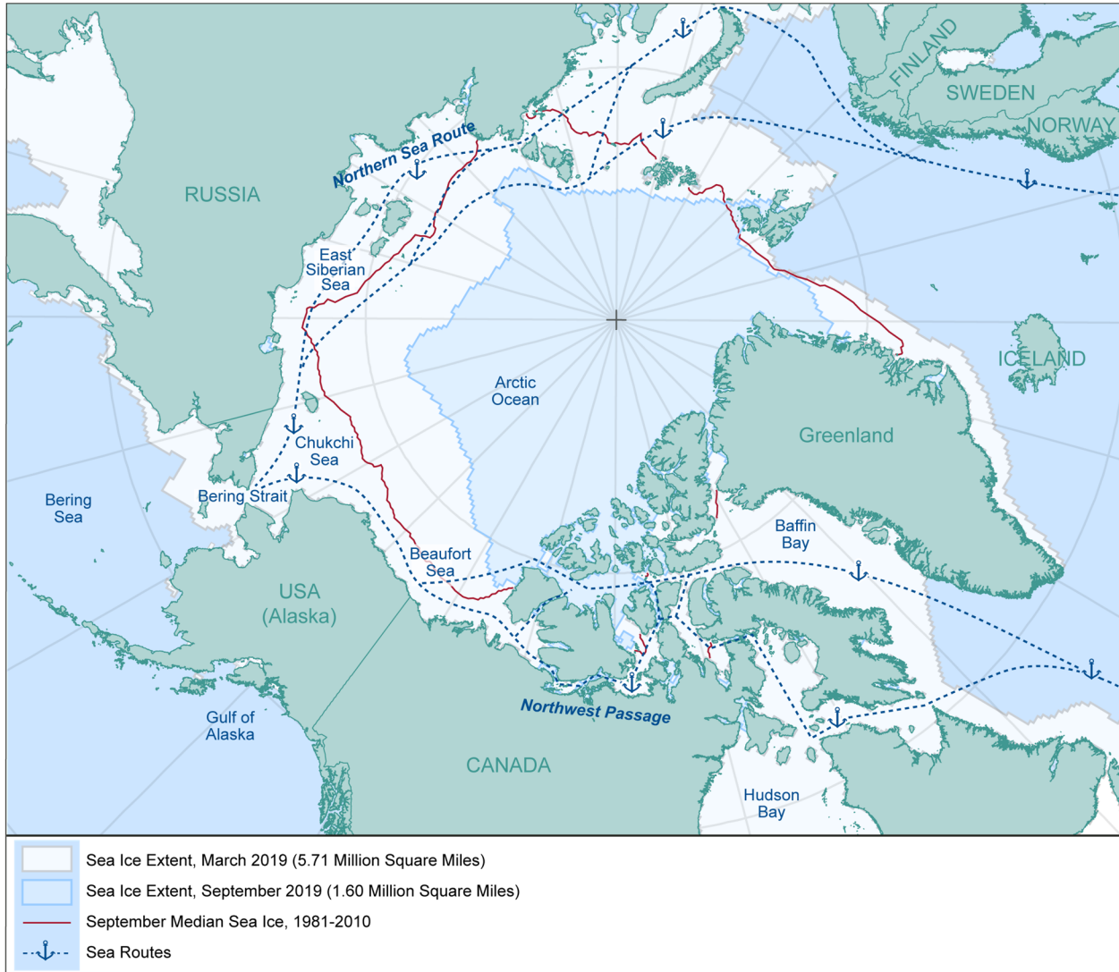
Figure 2: Trans-Arctic Maritime Routes and Arctic Sea Ice Extents from March and September 2019 compared with the September Median, 1981 to 2010

Sources: GAO analysis of National Snow and Ice Data Center; Office of Naval Intelligence; Map Resources. | GAO-23-106411