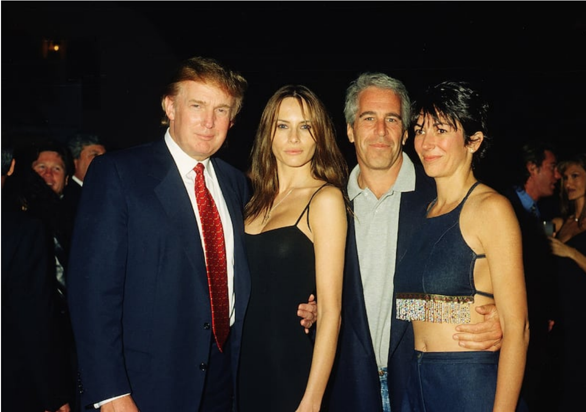
The long friendship between Trump and Epstein saw them party at Mar-a-Lago, including in February 2000 when they posed with their then-girlfriends, Melania Knauss and Ghislaine Maxwell. Melania became First Lady; Maxwell is serving 20 years in federal prison.

In 2022 Ghislaine Maxwell, Epstein's former girlfriend who procured him underage girls, would be sentenced to 20 years in federal prison for the sex trafficking of minors. Upon hearing of her arrest in 2020, Trump, then president, said he wished her well . "Her friend or boyfriend was either killed or committed suicide in jail. Yeah, I wish her well... Good luck."