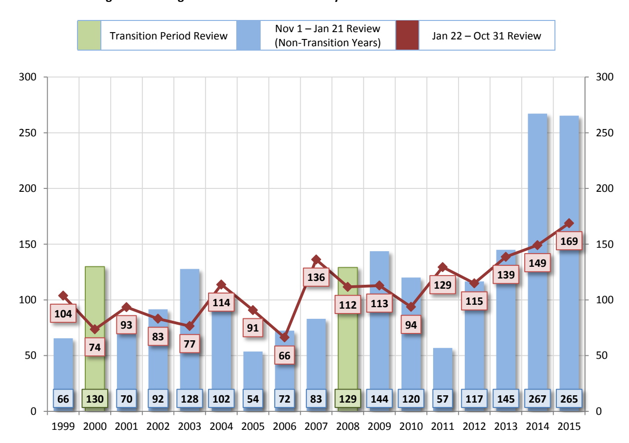
Figure 4: Average Cumulative Number of Days Final Rules are Under OIRA Review

Economically Significant final rules with completed OIRA reviews in the Transition Periods of 2000 and 2008 underwent an average of 130 cumulative days of OIRA review. That was 15 days longer than final rules with completed OIRA reviews in non-Transition Periods from 1999 through 2015 (115 days). [Figure 4]