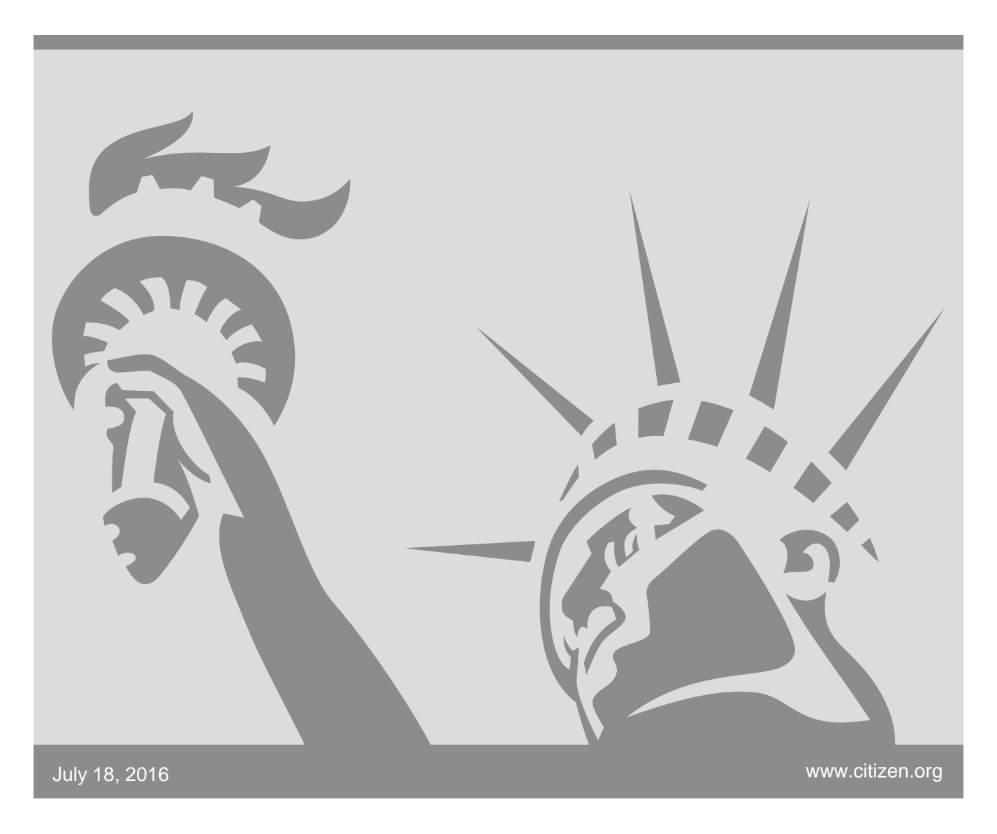
Shining a Light on the "Midnight Rule" Boogeyman

An Analysis of Economically Significant Final Rules Reviewed by OIRA