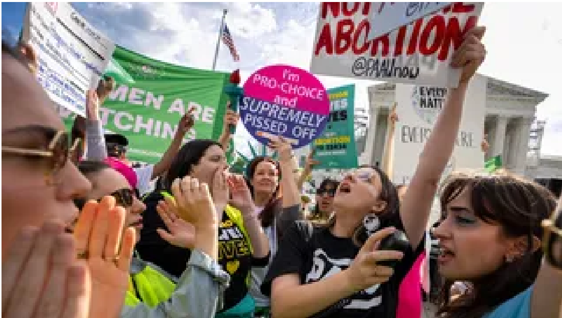
Abortion rights and anti-abortion supporters clash outside the Supreme Court on April 24.

The Supreme Court threw out its biggest abortion-related case since overturning Roe v. Wade two years ago, saying on Thursday that doctors opposed to a commonly used abortion pill lacked legal standing.