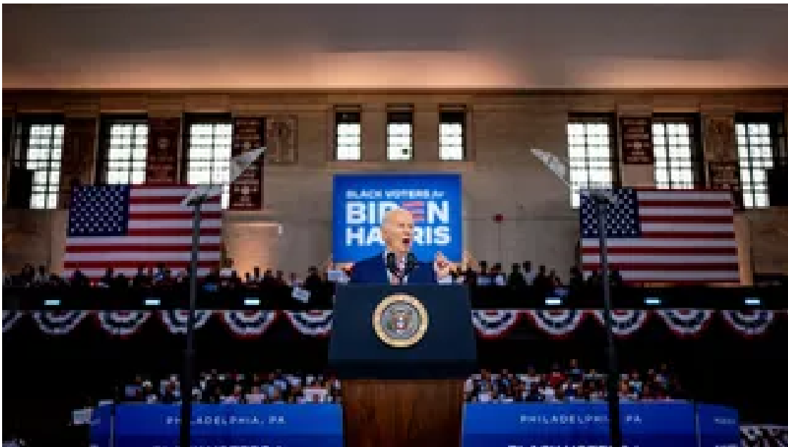
President Biden speaks during a campaign rally at Girard College on May 29 in Philadelphia.

A conservative group with close ties to the House GOP leadership is launching a $9.5 million ad campaign targeting 10 vulnerable Democrats on immigration, Axios has learned.