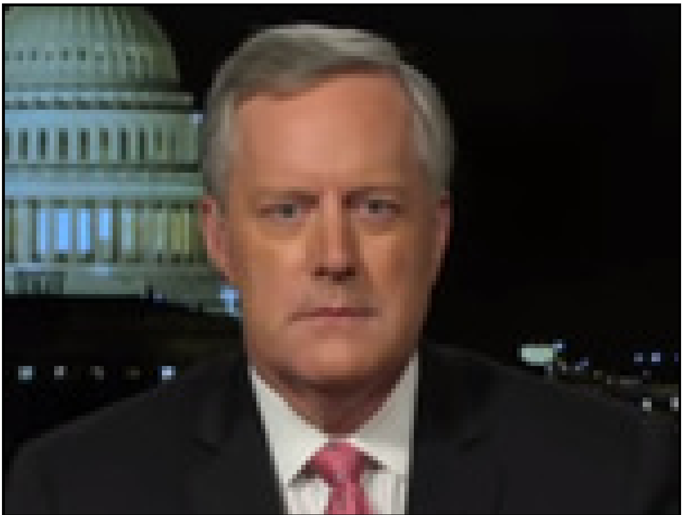
📺 Meadows: Jerry Nadler Is Going Crazy Because He Knows The Truth About Spycgate Is Coming Out