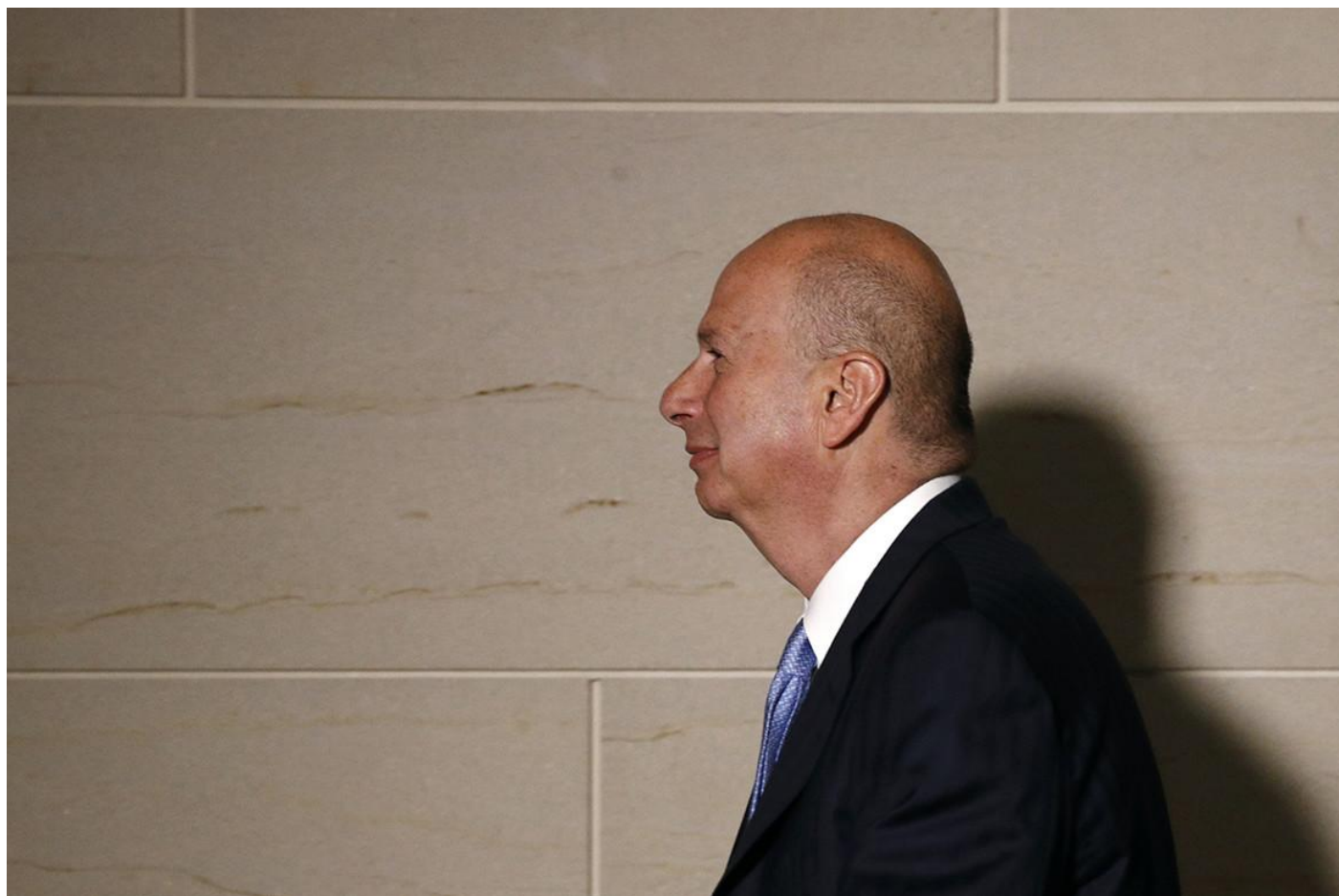
Ambassador to the European Union Gordon Sondland.

A key figure in the Ukraine saga revised his testimony for impeachment investigators.