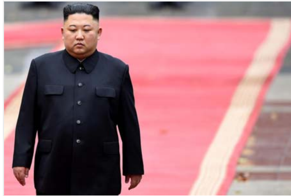
2 POLITICS North Korea conducts another test at long-range rocket site