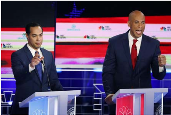
1 2020 DEMOCRATIC DEBATES DNC balks at effort to alter debate qualifications