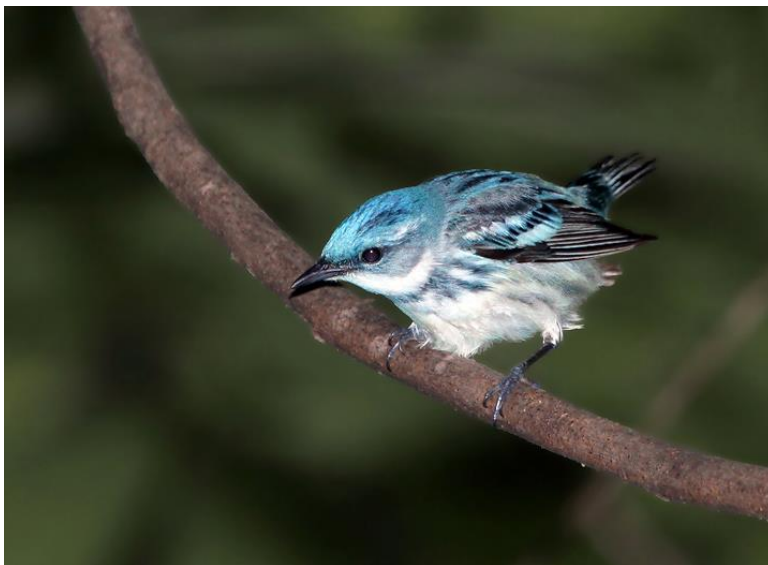
The Cerulean Warbler population has declined 70 percent over the past forty years.

Chairman Huffman, Ranking Member McClintock, and Members of the Subcommittee, on behalf of American Bird Conservancy, which works to conserve birds and their habitats throughout the Americas, please consider these comments on the need to strengthen protection for migratory birds and to highlight key elements of Rep. Alan Lowenthal's commendable Migratory Bird Protection Act discussion draft .