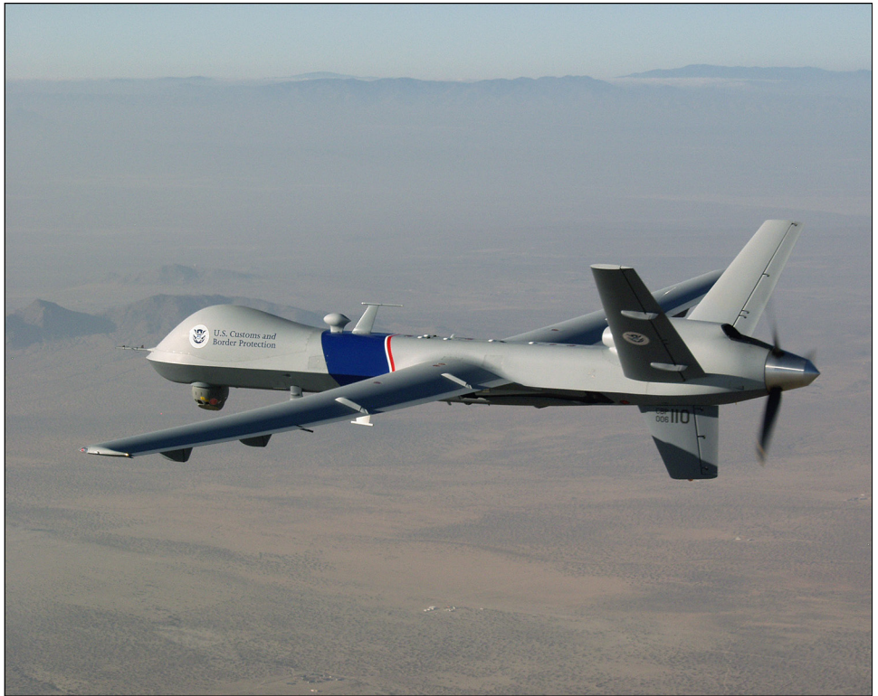
Figure 1: U.S. Customs and Border Protection (CBP) Predator B Aircraft