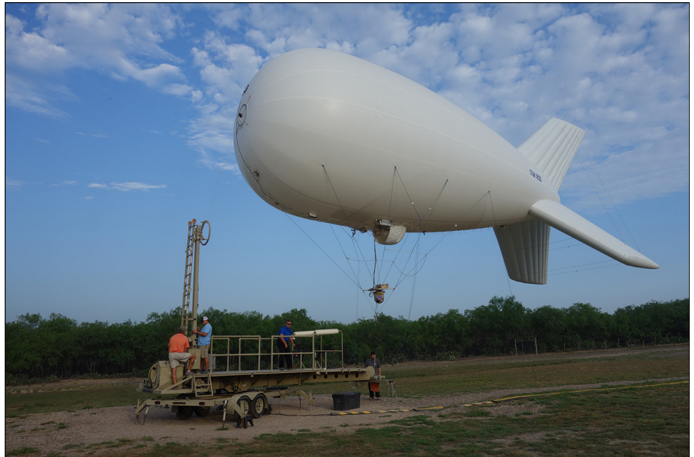
Figure 3: U.S. Customs and Border Protection Rapid Aerostat Initial Deployment (RAID) Aerostat