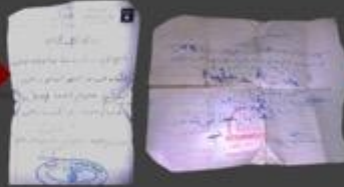
PERMIT FOR LOOTING