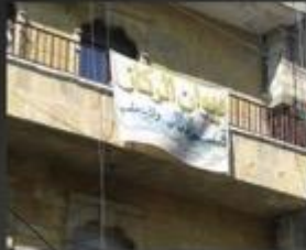
DAESH ANTIQUITIES DEPARTMENT IN MANBIJ, SYRIA

Daesh's Diwan al Rikaz (Office of Resources) has established a Department of Antiquities.