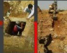
LOOTING WITH DAESH PERMIT