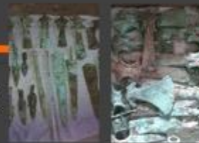
IF NO BUYER IS FOUND...