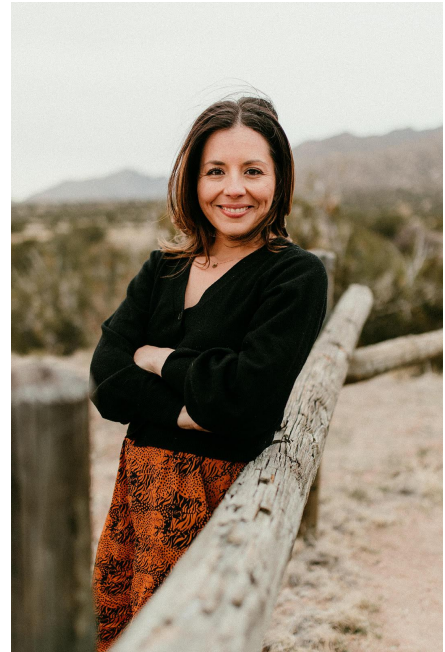
President, Co-founder, EquisLabs