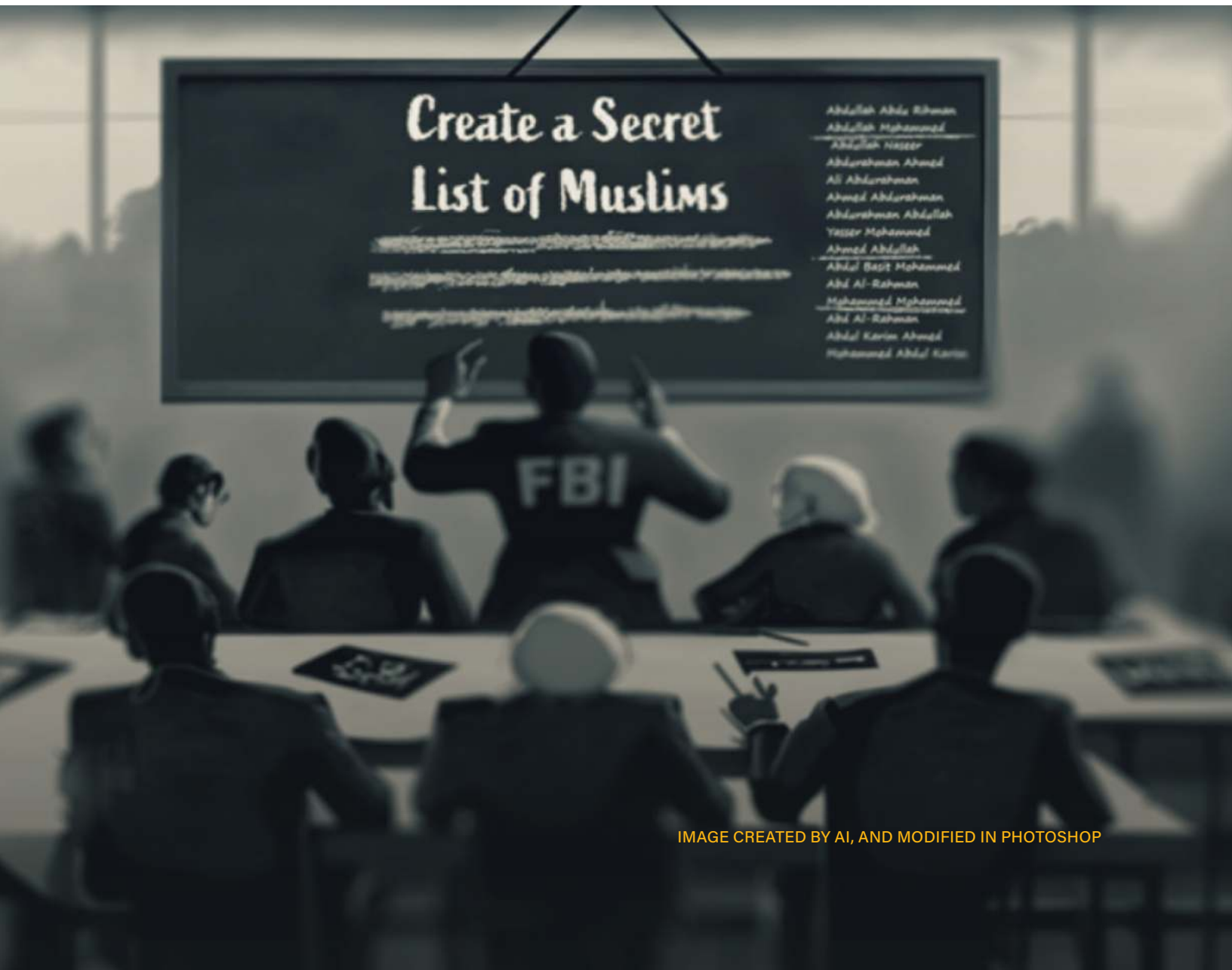
IMAGE CREATED BY AI, AND MODIFIED IN PHOTOSHOP

We are raising the alarm. This can and will happen to all of us, from every community, even those beyond the Muslims currently filling the FBI's list. We call on all Americans to join our demand that the FBI stop sharing its secret list as a first step to responsibly unwinding it.