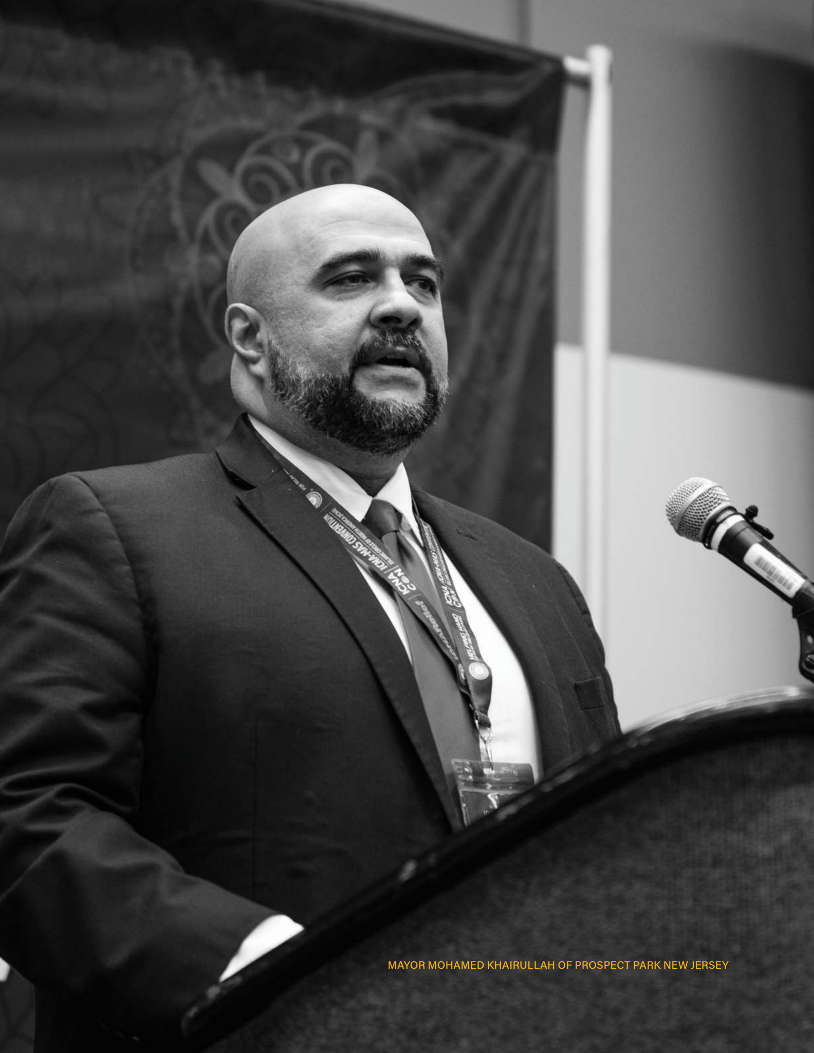
MAYOR MOHAMED KHAIROLLAH OF PROSPECT PARK NEW JERSEY