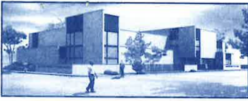
Branch 11's Headquarters: James E. Worsham Bldg.