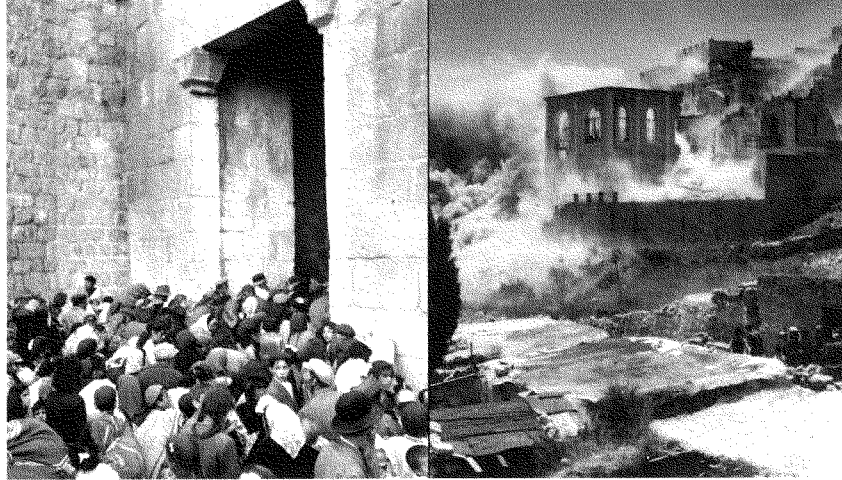
Left: Jewish residents fleeing their homes in the Old City through the Zion Gate. The Jews of the Old City were either killed, expelled or imprisoned following Jordan's invasion of Jerusalem in 1948 – what today would be known as ethnic cleansing. Right: The Porat Yosef Yeshiva is blown up by the Jordanians after the fall of the Jewish Quarter in 1948 and the expulsion of its residents. The Jordanians blew up and damaged dozens of synagogues and desecrated the ancient Mount of Olives cemetery (Photos: John Phillips, LIFE Magazine , Getty Images, 1948).

Again, this is not just a history lesson. In March 1999, when I served as Israel's ambassador to the UN, there was an initiative underway to revive Resolution 181 with respect to Jerusalem. This effort was supported by members of the European Union, several Arab states, and by the PLO. I doubted that the Palestinians really wanted internationalization, but it served as a convenient instrument for prying Jerusalem away from Israel.