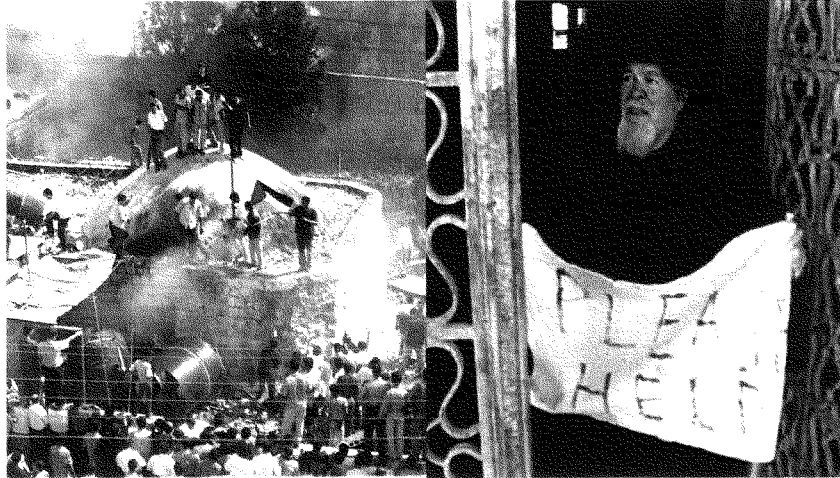
Left: Palestinians stand on the roof of Joseph's Tomb in Nablus on October 7, 2000, after Palestinian fighters and civilians stormed the Israeli enclave, destroyed holy books and set the sacred site ablaze in a victory "celebration" held shortly after the IDF evacuated the site. Right: A Greek Orthodox priest, held hostage in Church of the Nativity in Bethlehem by Palestinians who entered forcibly, seized the Christian clergy as hostages, looted church valuables and desecrated Bibles, holding a sign saying "PLEASE HELP," April 2002.