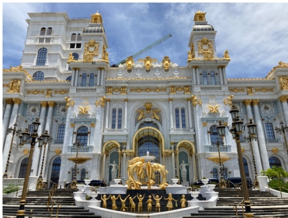
Figure 1: Now closed PRC-linked casino in Saipan.

They also established political and economic influence and an exclusive licence was granted to a Chinese casino operator that was, explained the Governor, “mired in litigation and criminal investigation practically from the start... The Chinese casino on Saipan at its peak raked in billions of U.S. dollars in monthly rolling chip volumes from just 16 VIP tables, outdoing even the glitziest casinos in Macau.”