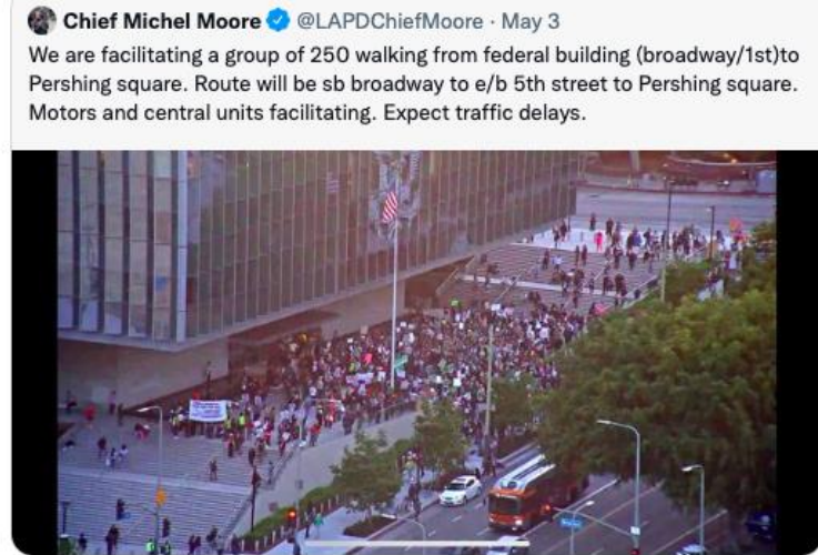
12:06 AM · May 4, 2022 from Los Angeles, CA · Twitter for iPhone

Receiving update on protest @ Pershing Square. A segment of the group began to take the intersection. We attempted to communicate, clear and provide dispersal order to the group. Crowd began to throw rocks and bottles at ofcrs . We have one ofcr injured( Unk extent).