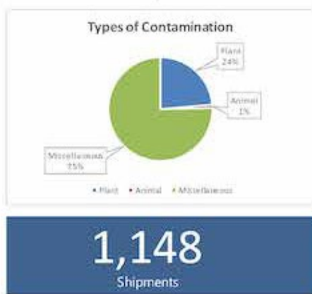
Fiscal Year 2022 Quarter 1 - Agriculture Inspections - Contaminated Products Agriculture Enforcement Actions in Response to Contaminants Associated with Imported Cargo Shipments