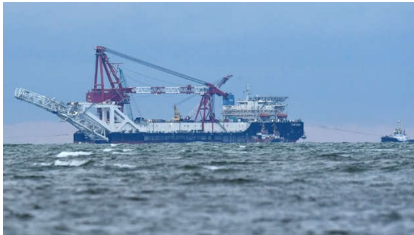
The Fortuna is a pipe-laying ship working on the Nord Stream 2 project

The Biden administration has waived sanctions on a company building a controversial gas pipeline between Russia and Germany.