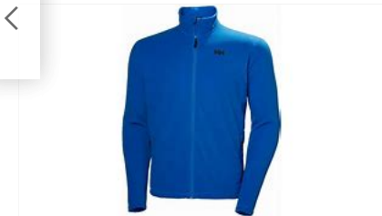
Helly Hansen Daybreaker Full Zip Fleece Jacket - Blue - Casual...