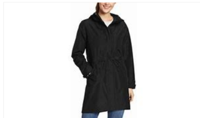
Eddie Bauer Women's Rainfoil Trench Coat - Black - M-$89.50