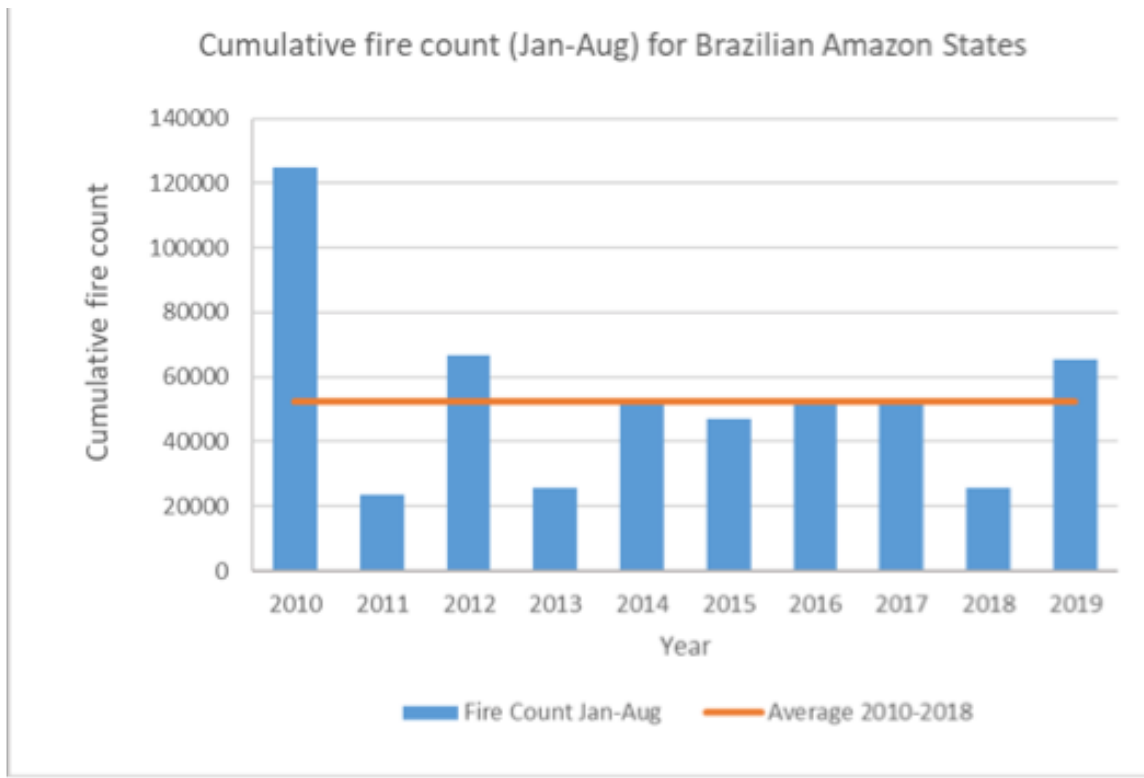
Figure 2. Fire count January through August for the Brazilian States of the Amazon. Source data: Global Fire Emissions Database ( www.globalfiredata.org ; accessed Sept. 05, 2019). Analysis by Earth Innovation Institute.