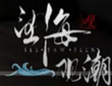
(4/26) CCTV: Looking at the sea and watching the tide | Doxing NED

Video segment: Under the guise of democracy, NED's background is ideological penetration, subversion, and destruction.