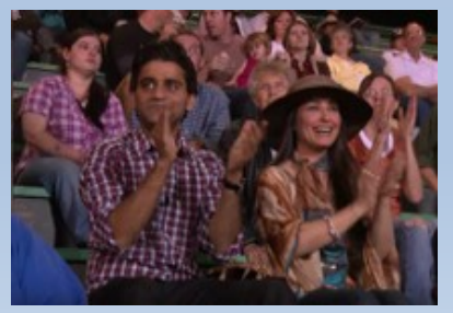
International Town Halls