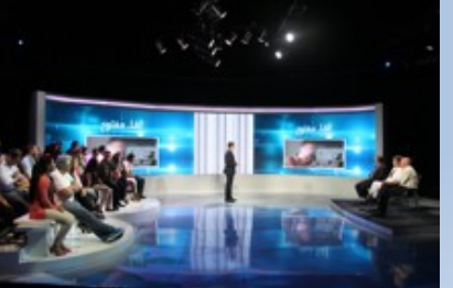
Tunisia Town Hall