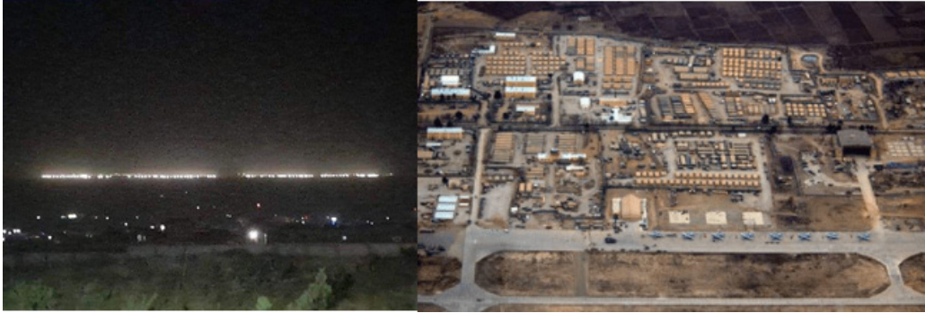
Figure 1. Left: Open-source available images taken 2 October 2021, of Bagram Airfield, Parwan. Right: Aerial photographs taken shortly thereafter, proclaiming to indicate the presence of Chinese aircraft.

to embarrass and undermine the United States in the information environment.