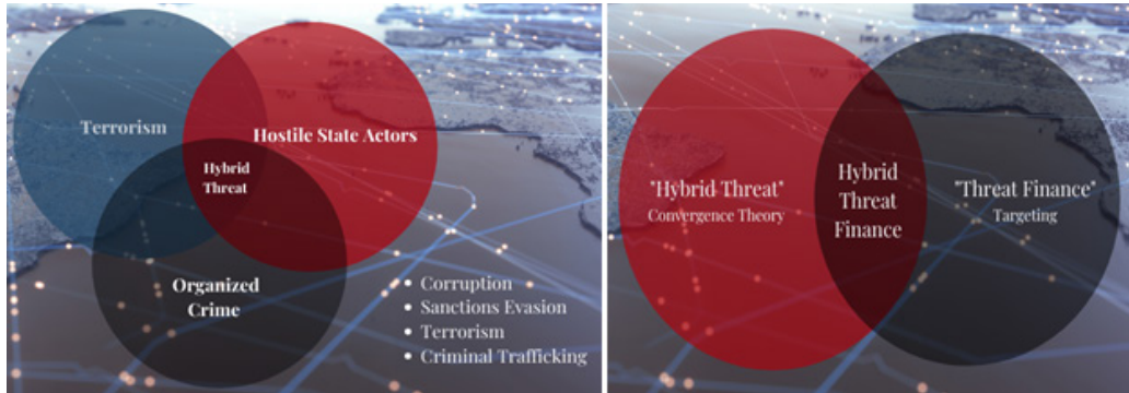
Figure 2. Left: “Hybrid Threat” convergence theory. Right: Hybrid Threat Finance (HTF) targeting doctrine.

ganized crime in the form of drug, weapons, or human trafficking; or offensive cyber operations.