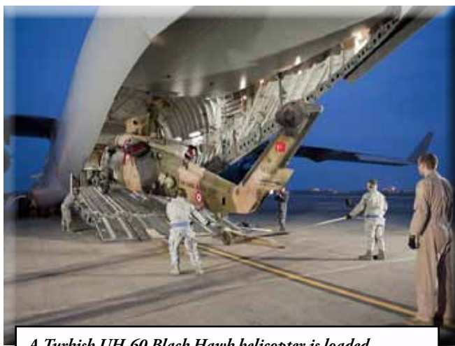
A Turkish UH-60 Black Hawk helicopter is loaded onboard a U.S. Air Force C-17 Globemaster at Incirlik Air Base, Turkey, for deployment to Kabul. EUCOM will provide indispensable logistical capacity and collaboration with U.S. Transportation Command to conduct significant U.S. and allied retrograde and redeployment operations from Afghanistan in 2013 and 2014.

European Command is involved in a wide range of supporting activities to enable a successful transition in Afghanistan in accordance with the 2012 Defense Strategic Guidance and NATO’s Chicago Summit Declaration. As mentioned, European Command continues to leverage Section 1206, Coalition Support Fund, Coalition Readiness Support Program, and a host of other security assistance programs to provide the critical training and equipment that enable our European allies and partners—particularly Central and