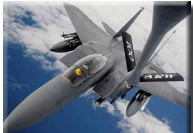
An F-15E Strike Eagle conducts in-flight refueling with a KC-135 Stratotanker over the Atlantic Ocean. U.S. Air Forces Europe conducts operations for 4 U.S. Combatant Commanders—European Command, Africa Command, Central Command, Transportation Command—and supports U.S. commitments to NATO.

Recent combat support operations in North Africa highlighted the importance of our ability to interoperate with NATO and non-NATO coalition partner nations in all phases of the ISR mission. To this end, we have dramatically increased our contact with potential partners to build partner ISR capacity. Leading the success in this area is the joint U.S. / U.K. 'Project Diamond' initiative, begun in 2007, which seeks to develop a Distributed Common Ground System (DCGS) ISR imagery processing, exploitation, and dissemination capability. This capability, located in the United Kingdom, is tied to the 693rd ISR Group at Ramstein Air Base. A significant success story, Project Diamond has resulted in U.K. analysts conducting processing, exploitation, and dissemination (PED) of U.S. Predator and Reaper Unmanned Aerial System operations in Afghanistan since April 2011. These efforts have supported ISAF warfighters while demonstrating the high degree of cooperation that exists between the U.S. and U.K. ISR communities. Building on these lessons, we have launched the Coalition ISR / PED Integration Initiative. This initiative seeks to build and integrate partner ISR capacity among key partner nations in the U.S. European Command and U.S. Africa Command theaters. These efforts will enhance cooperation, facilitate greater burden-sharing,