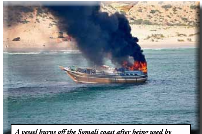
A vessel burns off the Somali coast after being used by pirates to attack the Dutch warship HNLMS Rotterdam. HNLMS Rotterdam, NATO's counter-piracy flagship, returned fire, disabling the vessel and scattering the attackers. NATO's Operation OCEAN SHIELD, in coordination with shipping industry best practices, continues to reduce episodes of piracy in waters off the Horn of Africa.

NATO Members Defense Commitments & Budgeting Outlook. The European financial crisis has had a security impact on NATO and partner nations. Few allies currently meet the NATO goal that each ally commits 2% of GDP to defense spending. The Smart Defense Initiative, Connected Forces Initiative, and NATO Forces 2020 all strive to fill capacity and capability gaps. However, at a time of uncertain security challenges and severe fiscal austerity it remains difficult, but still critical, to adequately fund defense spending.