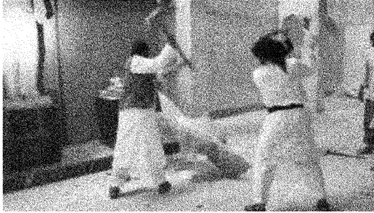
IS militants smashing antiquities at a Mosul museum.

will mean not only depriving a brutal terrorist group of crucial funding, but also preserving the priceless relics of our past.