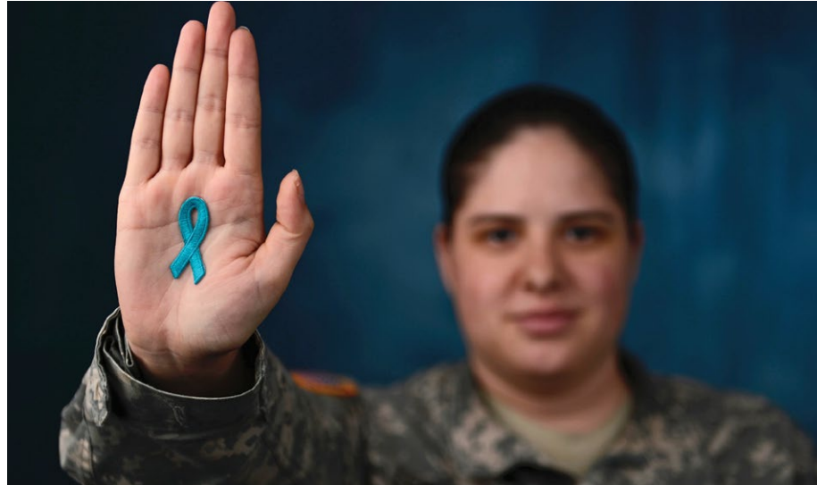
DoD has initiated sexual assault prevention and awareness programs.

Author of Conduct Unbecoming: Rape, Torture, and Post Traumatic Stress Disorder from Military Commanders