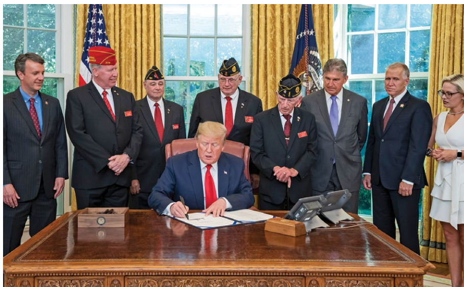
President Trump signs the 2019 LEGION Act in the Oval Office on July 30.