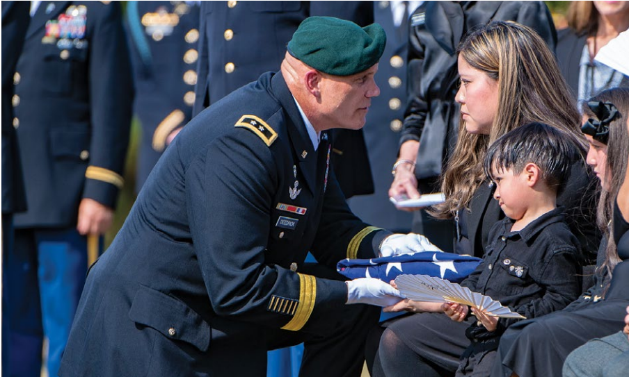
Gold Star families need continued support from veteran and military communities.