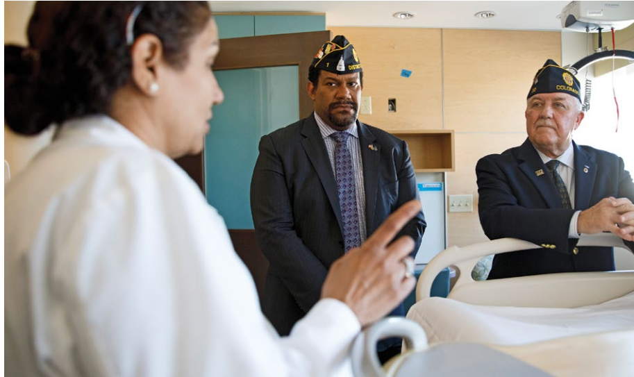
Legionnaires conduct a System Worth Saving site visit in Washington, D.C.