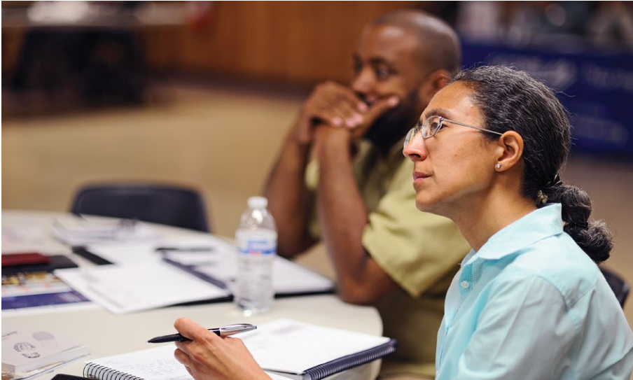
Boots 2 Business workshops help veterans transition to civilian careers.