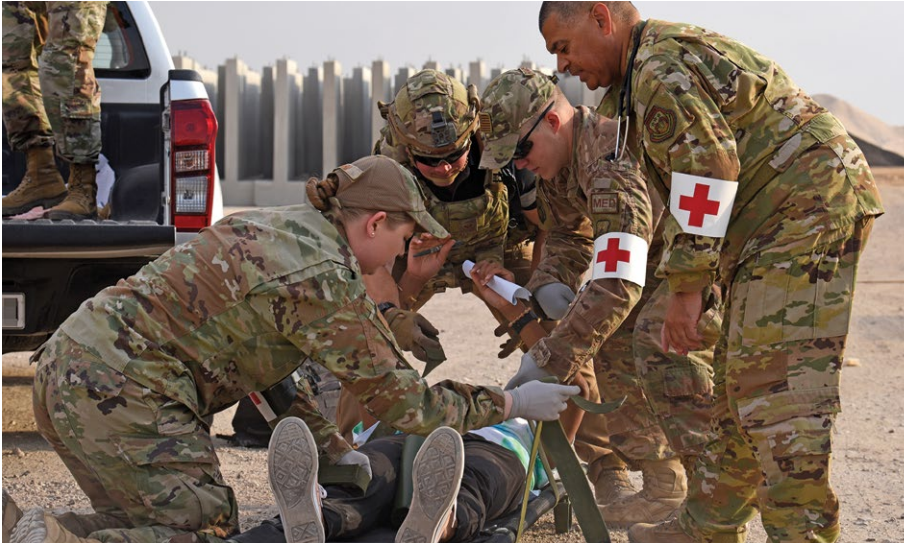
Joint training allows coalition forces to operate as a unified multi-lateral team.