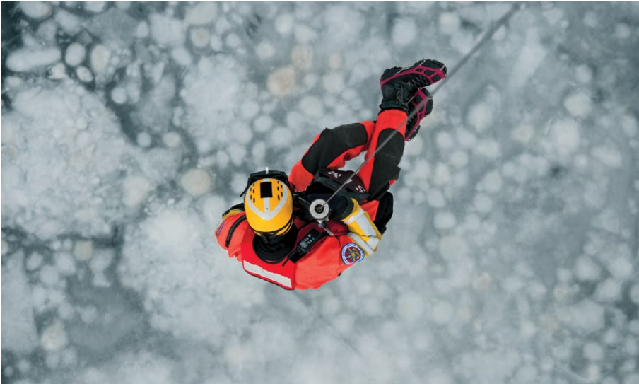
A Coast Guard aviation survival technician trains in Michigan.