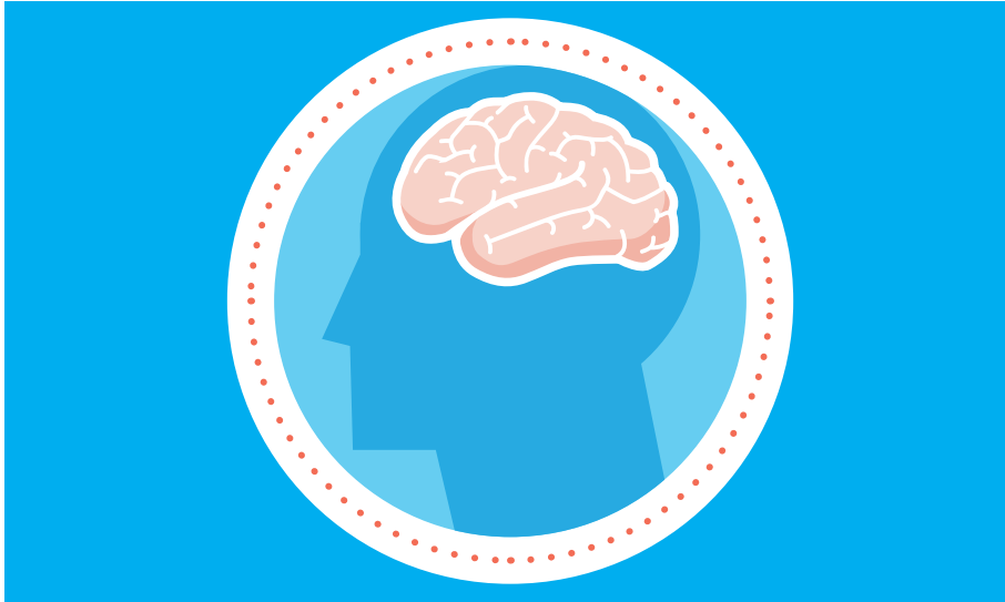
A 2019 American Legion survey revealed high interest in suicide-prevention training.