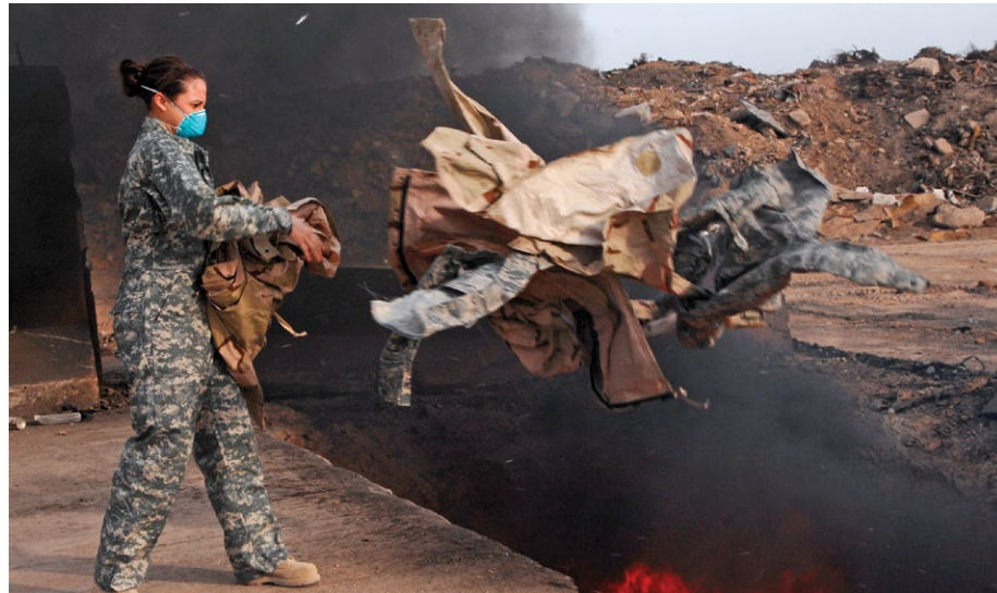
Studies into the effects of burn-pit exposure must be accelerated. DoD