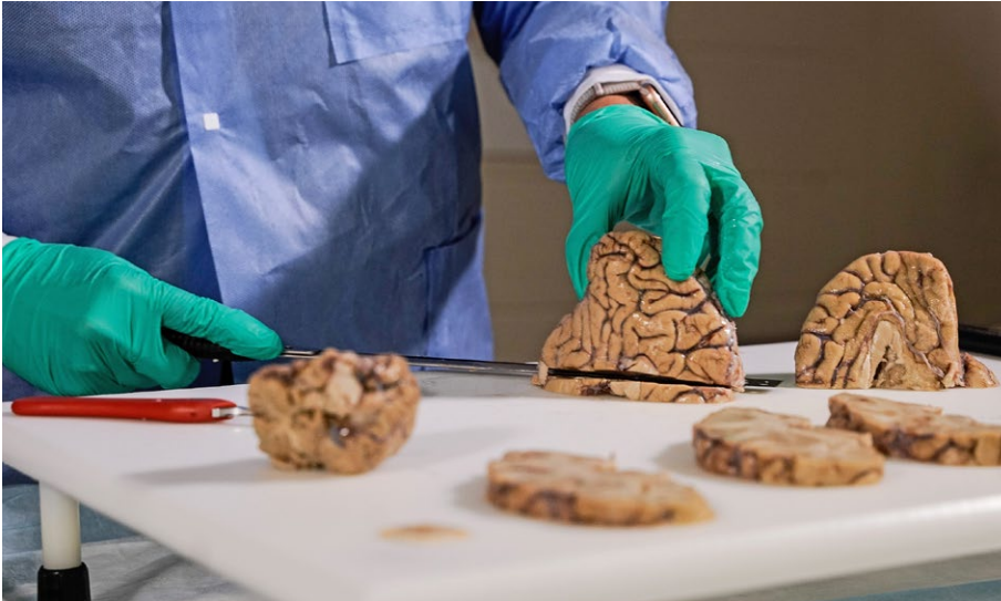
Research on donated brains helps scientists better understand effects of TBI.