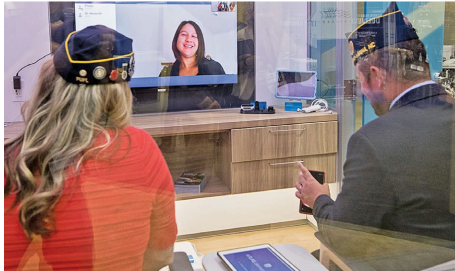
The Project ATLAS display at the 2019 American Legion National Convention.

VA Secretary Robert Wilkie, testifying at a joint congressional hearing Dec. 19, 2019.