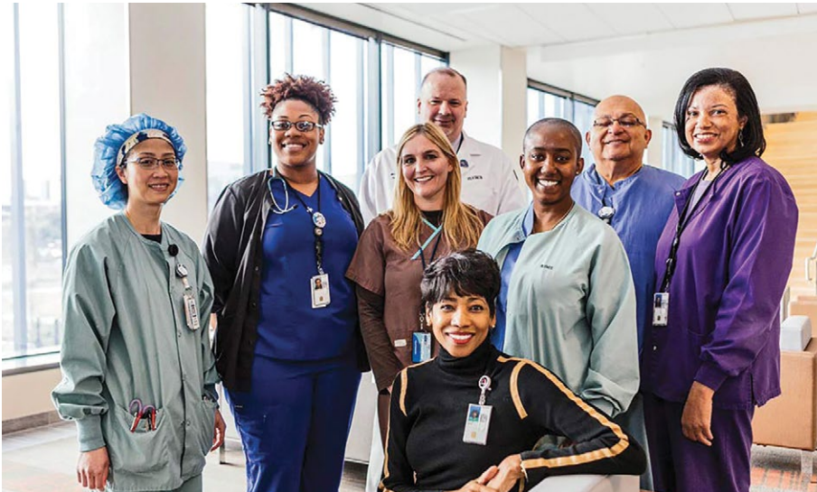
VA offers programs to attract and keep dedicated health-care professionals. VA