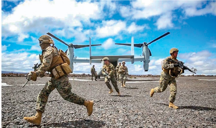
Marines disembark an MV-22 Osprey on a training mission in Hawaii.

Director of the United States Office of War Information during World War II and a Peabody Award recipient