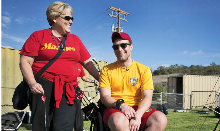
Caregivers of eligible veterans from all war eras deserve equal support. VA

Elizabeth Dole Foundation founder and former U.S. senator