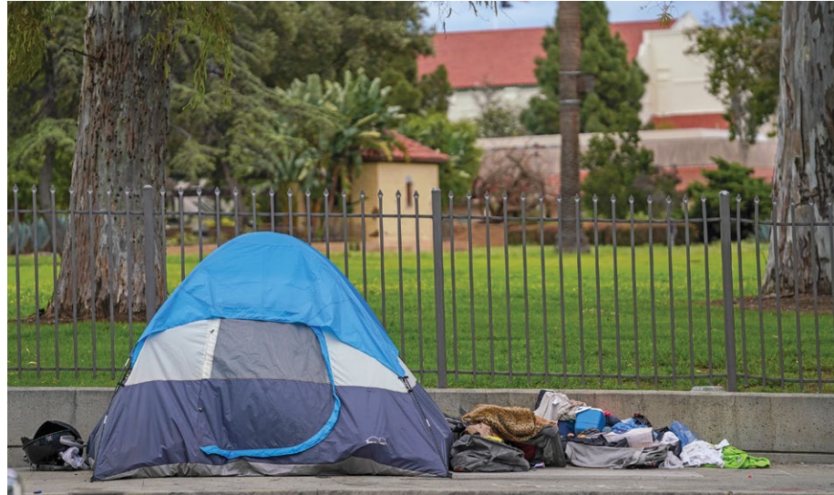
Homeless veteran encampments can be seen near the West LA VA campus. Schelly Stone

“ The recipe is deceptively simple: federal funding efficiently invested in communities. When given enough resources, and enough focus by leadership, communities are absolutely able to house every single veteran who needs help.