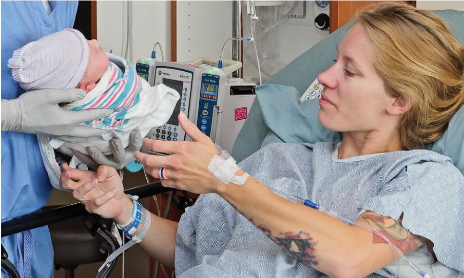
Improved maternity care helps support the unique needs of women veterans.