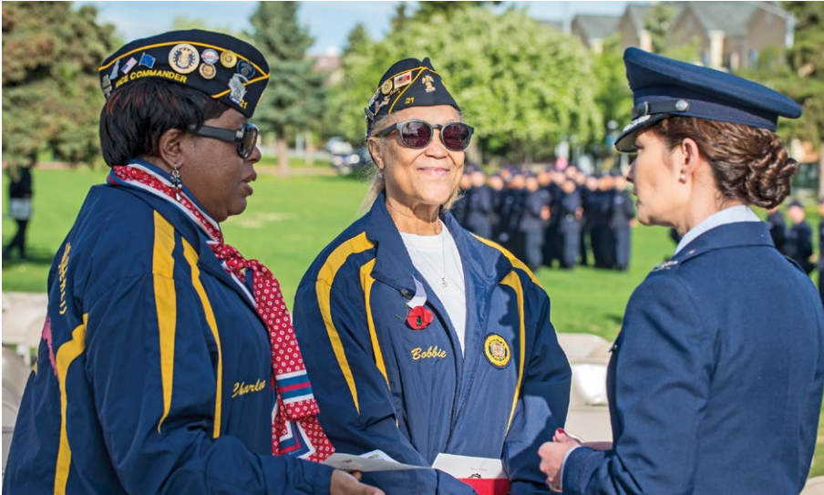
As more women serve in the military, the need for gender-specific VA care will grow. DoD