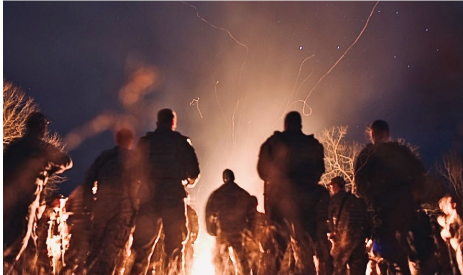
Joint training prepares forces for military interoperability.

General Mark A. Milley , then U.S. Army Chief of Staff, currently Chairman of the Joint Chiefs of Staff