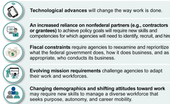
Figure 1: Key Trends Affecting Federal Work