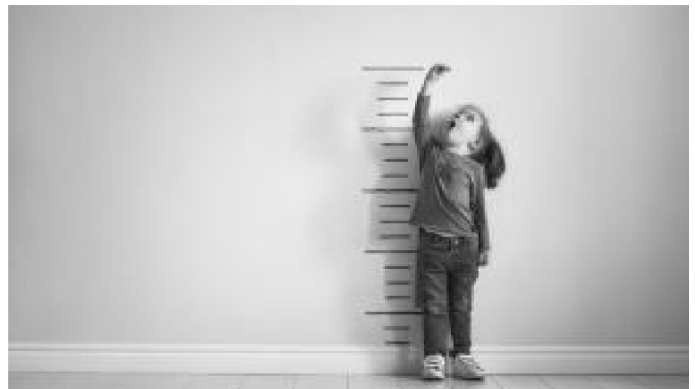
( https://www.pfizer.com/news/hot-topics/children_s_growth_awareness_week )

7 MYTHS ABOUT THE FLU VACCINE ( HTTPS://WWW.PFIZER.COM/NEWS/HOT- TOPICS/7_MYTHS_ABOUT_THE_FLU_VACCINE )