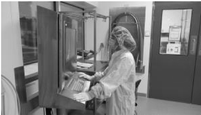
( https://www.pfizer.com/news/hot-topics/woman_made_hear_from_women_at_pfizer_with_careers_in_modern_manufacturing )

WOMAN-MADE: HEAR FROM WOMEN AT PFIZER WITH CAREERS IN MODERN MANUFACTURING ( HTTPS://WWW.PFIZER.COM/NEWS/HOT- TOPICS/WOMAN_MADE_HEAR_FROM_WOMEN_AT_PFIZER_WITH_CAREERS_IN_MODERN_MANUFACTURING )