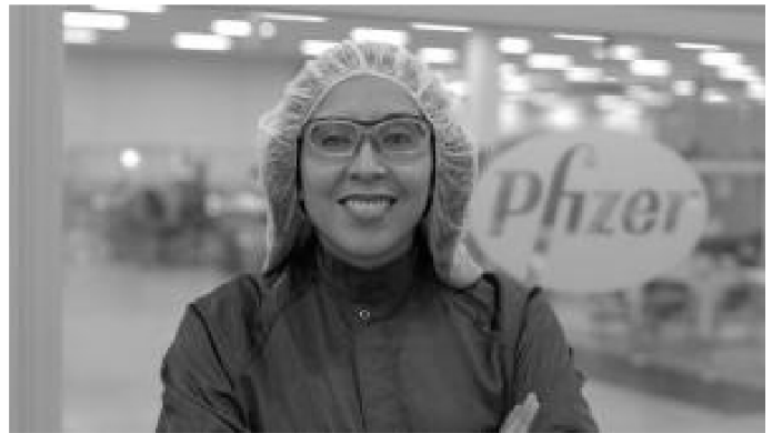
( https://www.pfizer.com/news/hot-topics/meet_our_manufacturers_inspiring_future_creators )

WOMAN-MADE: HEAR FROM WOMEN AT PFIZER WITH CAREERS IN MODERN MANUFACTURING ( HTTPS://WWW.PFIZER.COM/NEWS/HOT- TOPICS/WOMAN_MADE_HEAR_FROM_WOMEN_AT_PFIZER_WITH_CAREERS_IN_MODERN_MANUFACTURING )