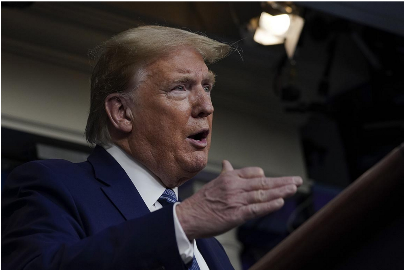
President Donald Trump has repeatedly touted a ban on travel from China as a key success in curbing the spread of coronavirus.

The Senate Republican campaign arm distributed the 57-page strategy document to candidates.