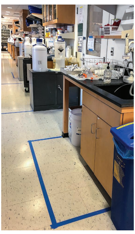
Markings are placed on the floor of an empty lab to promote social distancing.

tion to supporting the teaching and service missions of higher education-and health care delivery within academic medical centers—academic research contributes greatly to global economic development. In the United States, for example, higher education institutions accounted for $74 billion, or ~13%, of the $580 billion spent nationally on research and development in 2018 (1). More critically, these same institutions accounted for nearly half of the $96 billion spent on basic research nationwide, often seen as the seed corn for innovation and industry. Moreover, academic research institutions are among the top five employers in 44 of 50 U.S. states, employing more than 560,000 people (and more than 300,000 trainees) directly on research funds (2), many of which cannot perform their work remotely.