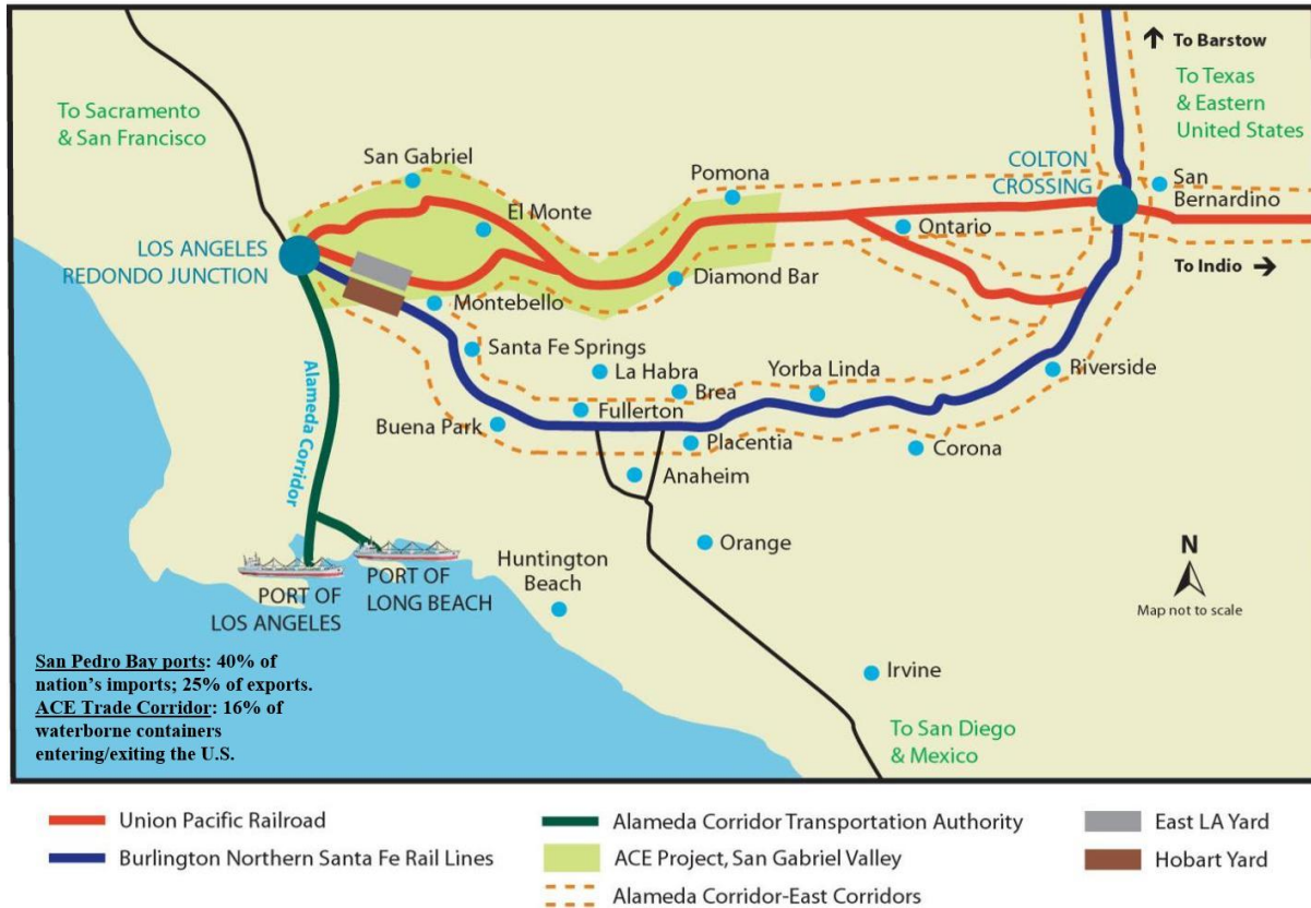
Exhibit 1 Alameda Corridor-East Corridors

result in more than 180 Union Pacific Railroad and BNSF trains per day traversing the ACE Trade Corridor, carrying 16% of all the Nation’s waterborne containerized freight (See Exhibit 1). In addition, dozens of daily Metrolink regional commuter trains operate on the freight rail mainlines under shared-use agreements.