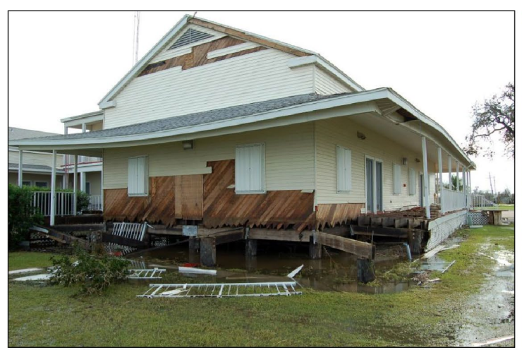
Figure 2. Coast Guard Station in Sabine Pass, Texas, Damaged by Hurricane Ike in 2008 and Rebuilt in 2013 to Be More Resilient