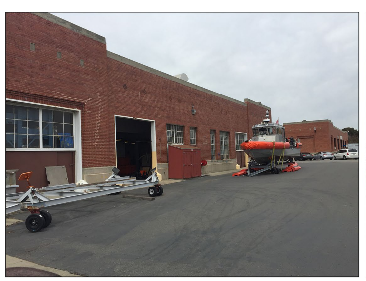
Figure 1: Coast Guard Maintenance Facilities Requiring Refurbishment because They Cannot Accommodate Newer, Taller Boats