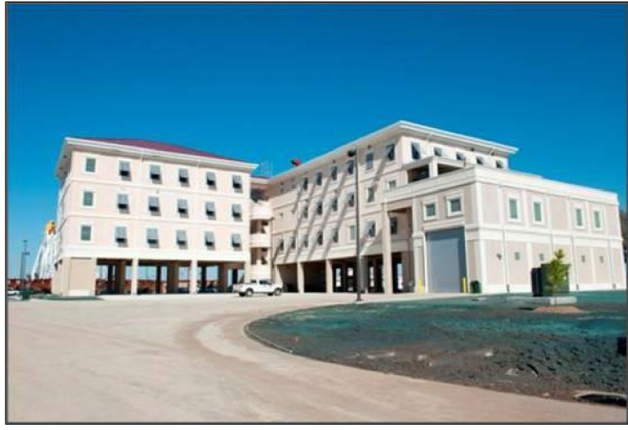
Station Sabine Pass rebuilt to withstand 100 year flood, category III hurricane wind speeds.

Source: U.S. Coast Guard. | GAO-22-105513