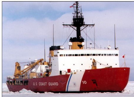
Figure 3: United States Coast Guard Icebreaker Polar Star

research center in Antarctica as both of its heavy polar icebreakers were inactive due to maintenance needs. The Coast Guard resumed this annual mission in 2014 following the reactivation of its other heavy icebreaker, the Polar Star , which is shown in figure 3.