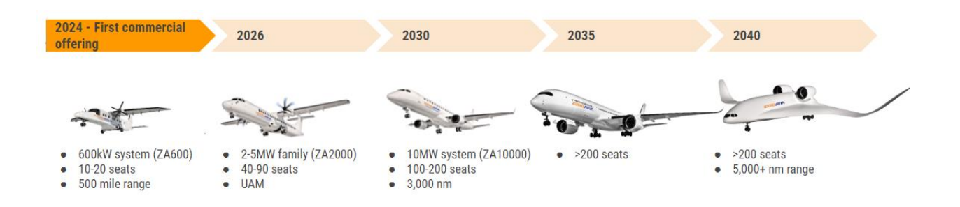
Figure 2: ZeroAvia's flight path - all segments, starting with 500-mile range, 10-20 seat capacity

Importantly, aviation is a great use case for hydrogen fuel-cell adoption, not just because it is a practical solution to aviation's climate change impacts, but also because the economics are attractive. With significantly lower material stresses compared to modern combustion turbines, major overhaul and repair costs will be significantly lower than they are for combustion engines. It is a common misconception that hydrogen fuel costs will be a barrier to aviation uptake when it is, in fact, likely to be a key selling point. Green hydrogen - which is made using only renewable energy and water - can have a cost today as low as $3 per kg, which is equivalent to $1.50 per gallon of jet fuel and which is, of course, already substantially below the current wholesale cost of jet fuel. For smaller operators in sub-regional and regional sectors, hydrogen-electric operation can already deliver dramatic cost savings. We calculate rapidly falling green hydrogen prices with $2.2/kg in the near term, and major governments, including the recently announced U.S. DOE effort, target $1/kg by the end of the decade. So, the environmental and economic cases are strong, but what does that mean for likely adoption?