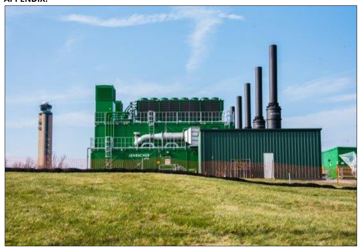
Pittsburgh International Airport Microgrid