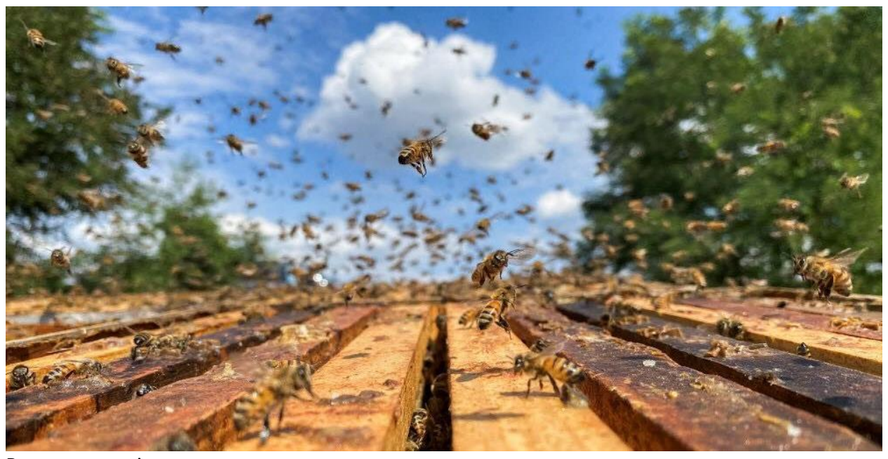
Bees at our apiary