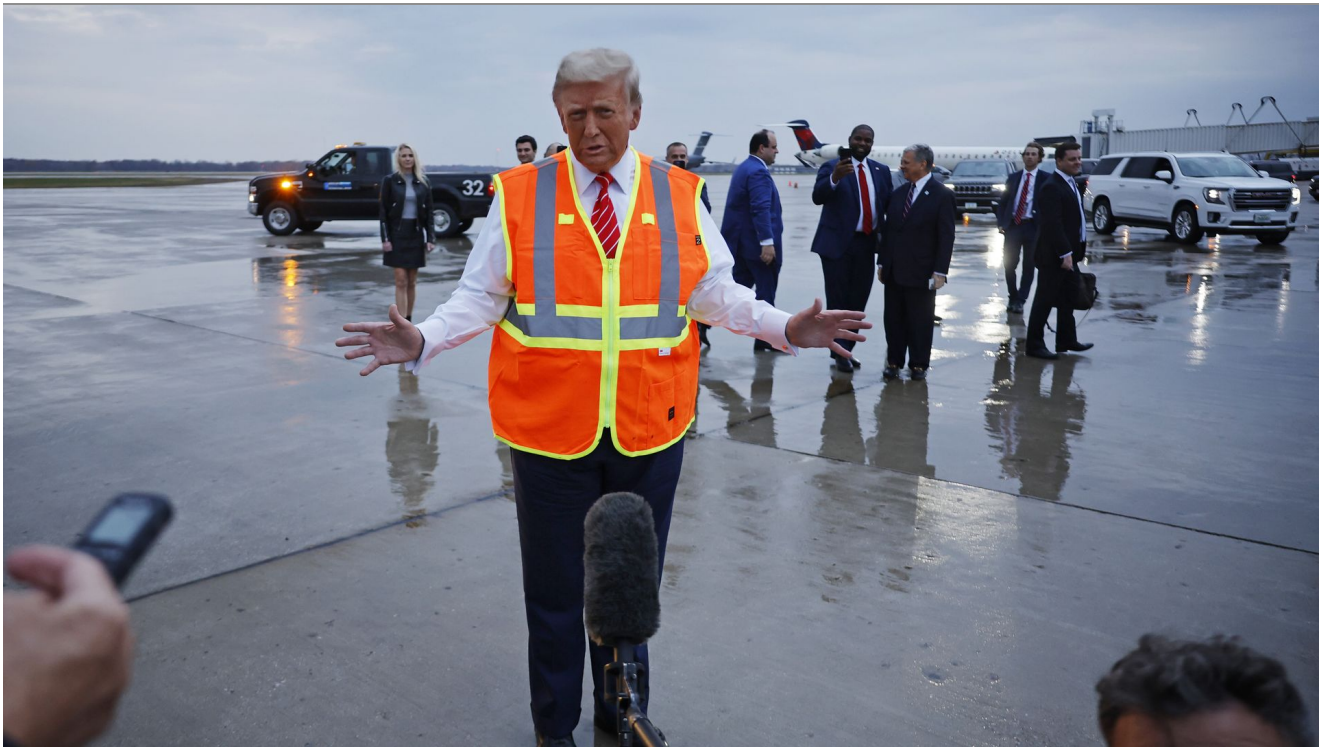
Former President Trump speaks to reporters while wearing a safety vest on the tarmac at Green Bay Austin Straubel International Airport on Oct. 30, 2024, in Green Bay, Wisconsin.

Former President Trump vowed to "protect" women "whether the women like it or not" at a Wisconsin rally Wednesday, drawing sharp blowback for a campaign that's already floundering with women voters .