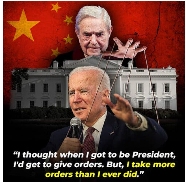
An image from a Trump campaign email, depicting the financier George Soros puppeteering President Biden.