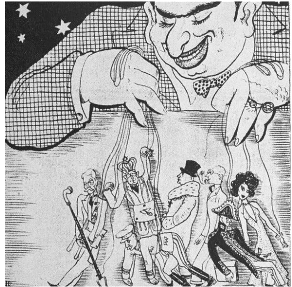
A 1940s cartoon from an antisemitic Hungarian publication, thought to depict a Jew puppeteering influential figures.