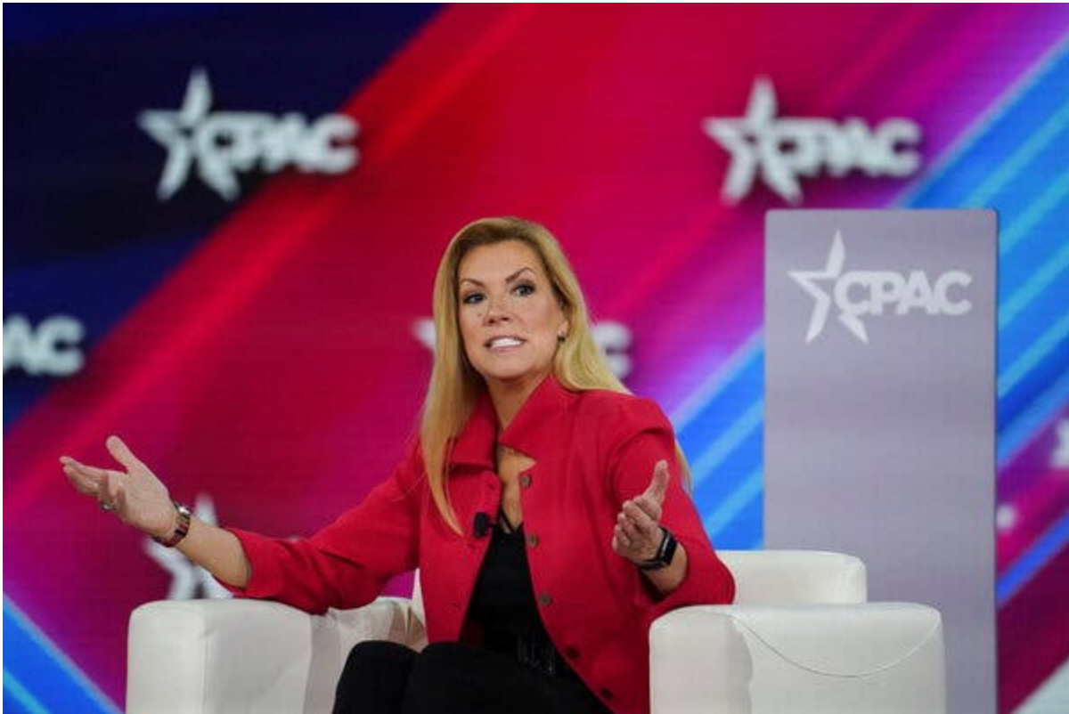
Representative Beth Van Duyne is among the Republicans who have blamed Mr. Soros for the pro-Palestinian protests.

Asked by The Times whether she was aware that the invocations of Mr. Soros are widely considered anti-Jewish in certain contexts, Ms. Van Duyne posted the questions and her response on X. In addition to funding “organizations that are driving antisemitism on college campuses,” she wrote, “Soros also funded the violent BLM movement, organizations who fought to defund the police, and helped elect pro-criminal district attorneys.”