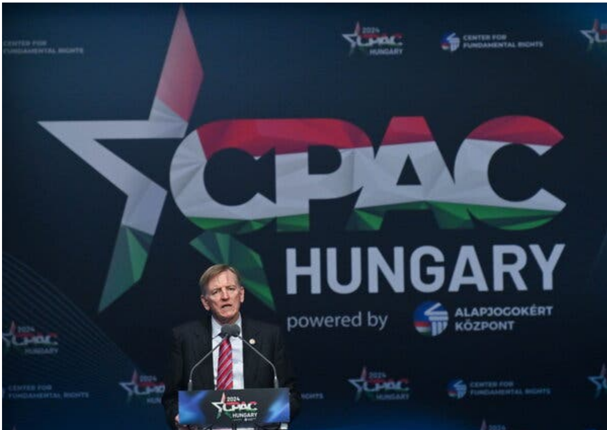
Representative Paul Gosar at this spring’s Conservative Political Action Conference in Hungary, whose right-wing nationalist prime minister has targeted George Soros.

On several occasions, Mr. Johnson has criticized the Manhattan district attorney prosecuting Mr. Trump by prominently referring to his indirect links to Mr. Soros. Last spring, in a newsletter to constituents, he called Mr. Bragg the “Soros-selected D.A.”