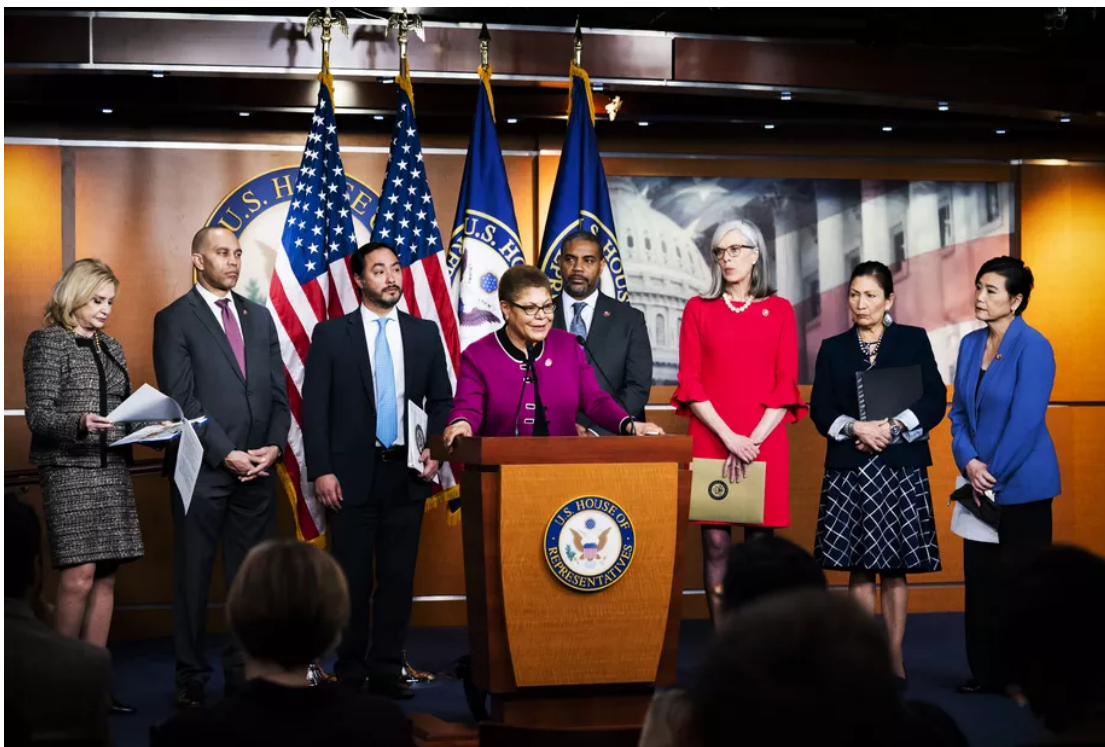
Members of the congressional Black, Asian, and Hispanic caucuses speak to reporters to discuss the 2020 census and the concern for getting an accurate count in minority communities on March 5.