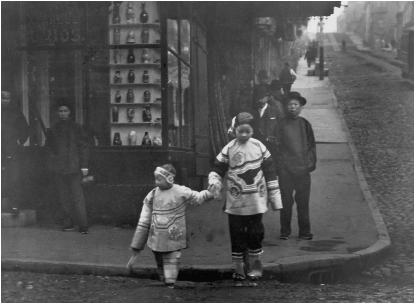
Two girls cross the street in front of a vase store in San Francisco's Chinatown in 1899.

In both cases, the vitriol toward Chinese Americans was driven by explicit racism, a fundamental lack of medical knowledge, and pushback toward the influx of Chinese laborers competing with white workers for job opportunities. Policy prescriptions were actively informed by assumptions that Chinatowns were a “laboratory of infection,” Trauner explains.