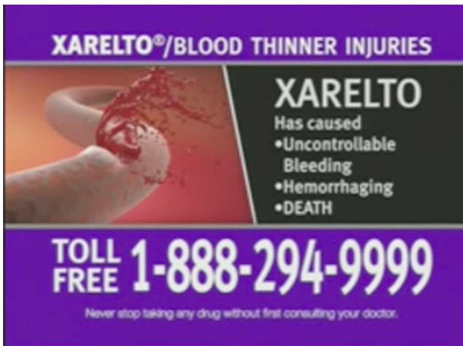
Figure 2: Advertisement, Unknown Sponsor

The narration in this advertisement states: