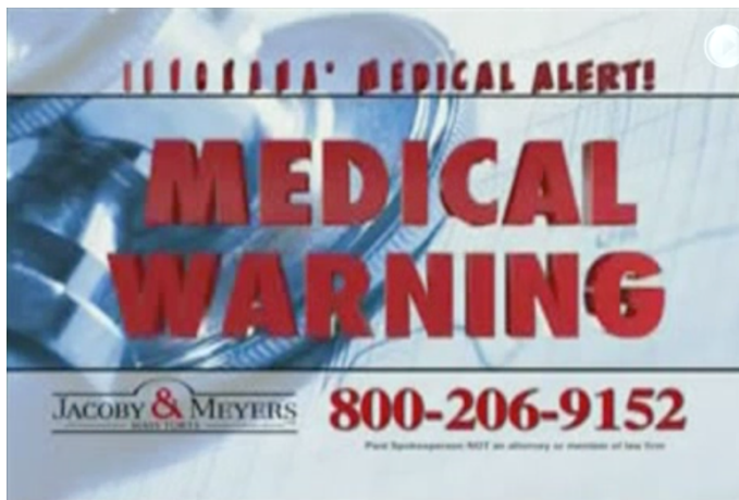
Figure 4. Invoking the FDA.