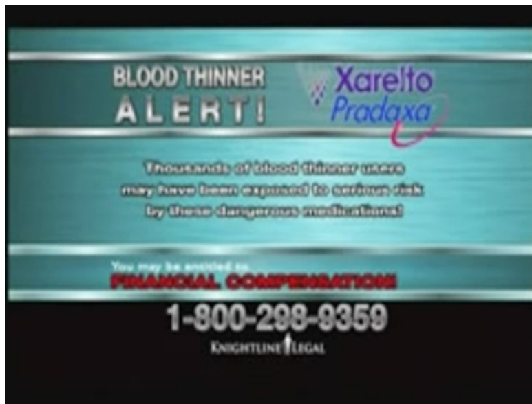
Figure 1. Advertisement from Knightline Legal

This advertisement has a mix of content, some of which is transparent about the purpose of the advertising, and some of which is less transparent. Transparent aspects of the ad include the sponsor’s name, which appears throughout the advertisement. This advertisement also uses the word “attorney” in the audio and in large font text in the middle of the ad - further signaling to the viewer that it is attorney advertising. Competing with this transparent language is the phrase “blood thinner alert” and the word “Attention” which appears at the start of the ad in large letters, which might imply that the advertisement has a different purpose than soliciting claims for a lawsuit. Although I have not tested how consumers respond to this particular ad, I would consider this advertisement “average” in the sense that it contains strong risk-related language but also provides numerous cues to the viewer about its purpose.