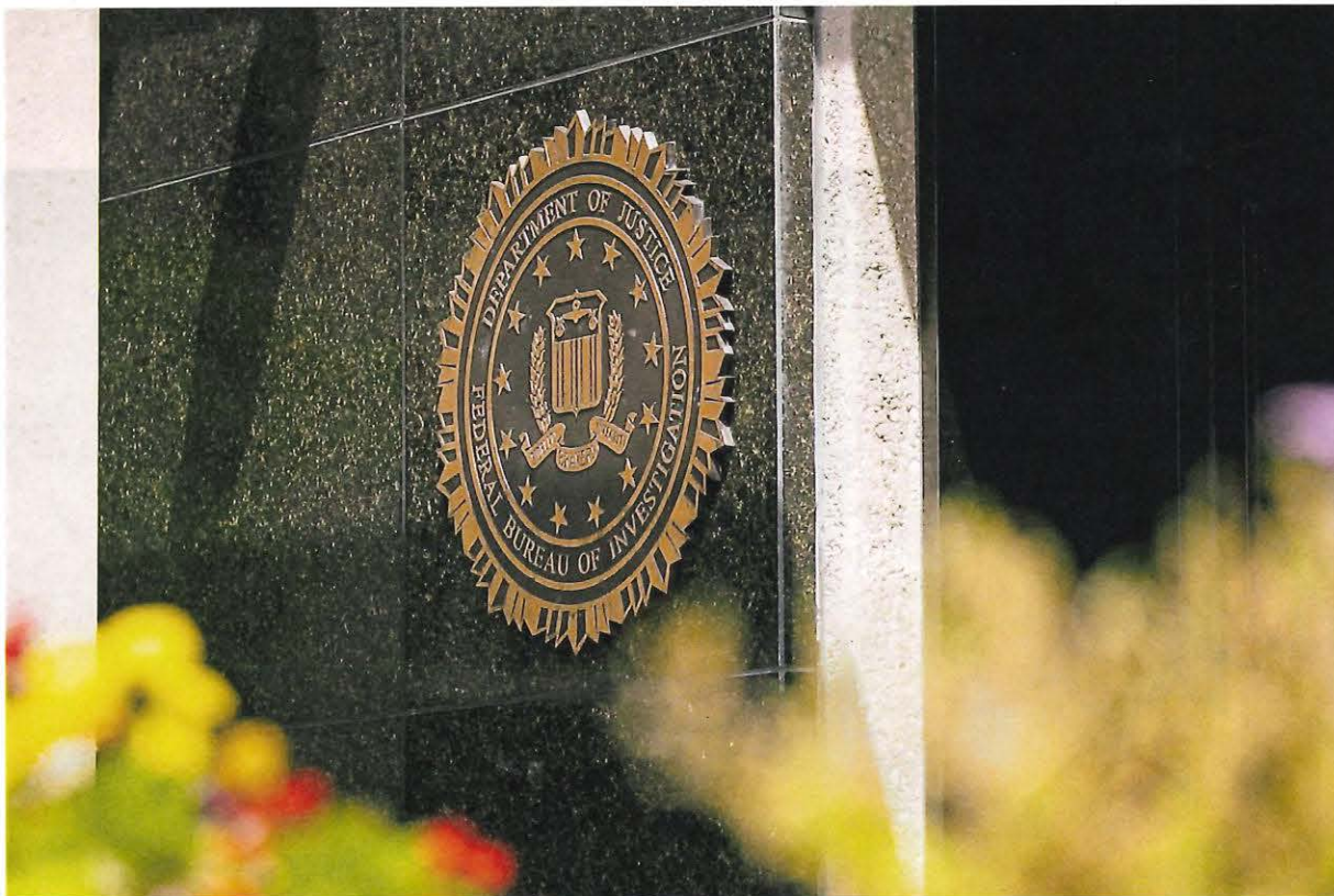
The Federal Bureau of Investigation (FBI) seal at its headquarters in Washington, D.C., Aug. 22, 2022.

"This continued historic decline in homicides does not represent abstract statistics. It represents people whose lives were saved -- people who are still here to see their children grow up, to work toward fulfilling their dreams, and to contribute to their communities."