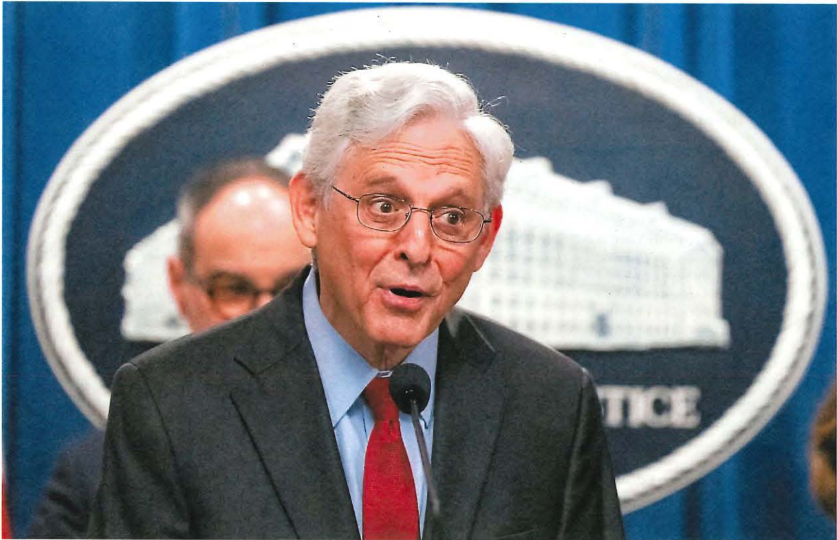
Attorney General Merrick Garland takes questions from reporters during a news confere...

Experts told ABC News late that year that the recent drop in homicides and other violent crimes can be attributed to expanded efforts to prevent crime, including working with community volunteers, targeting gun possession in high-crime areas and placing officers on foot and bike patrols.