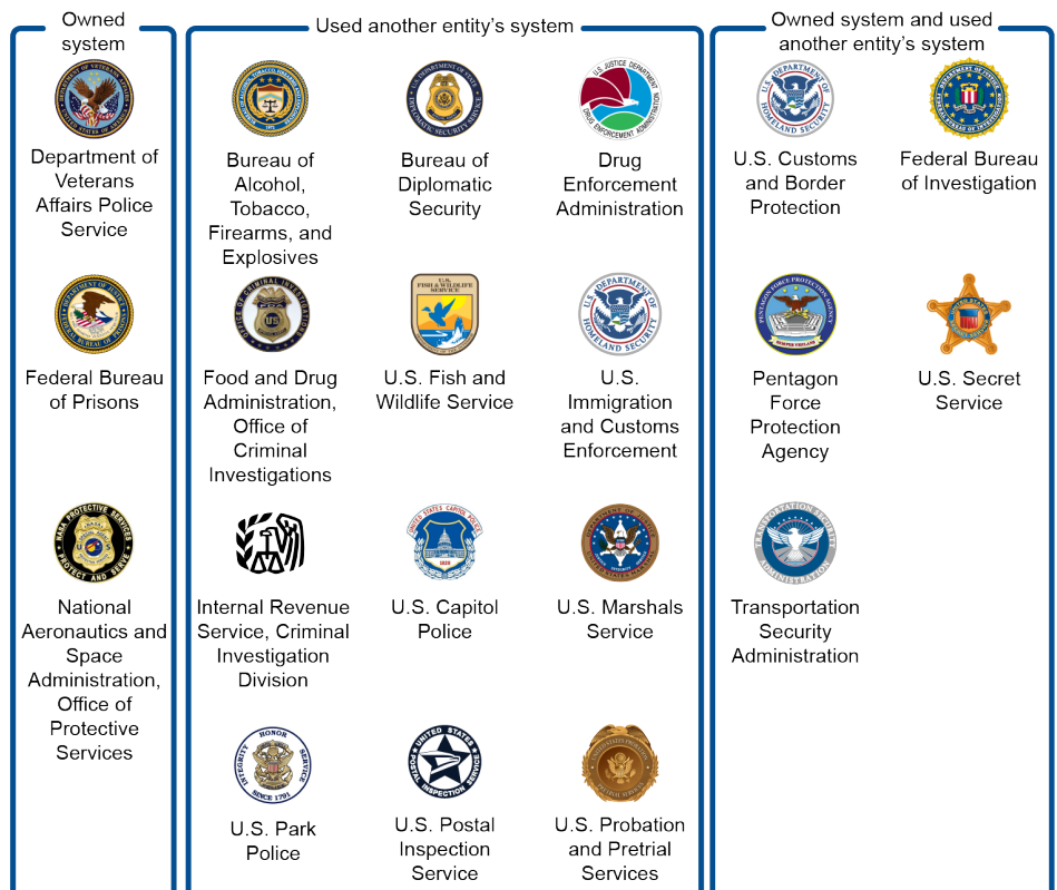
Ownership and Use of Facial Recognition Technology Reported by Federal Agencies that Employ Law Enforcement Officers

Source: GAO analysis of survey data. | GAO-21-105309