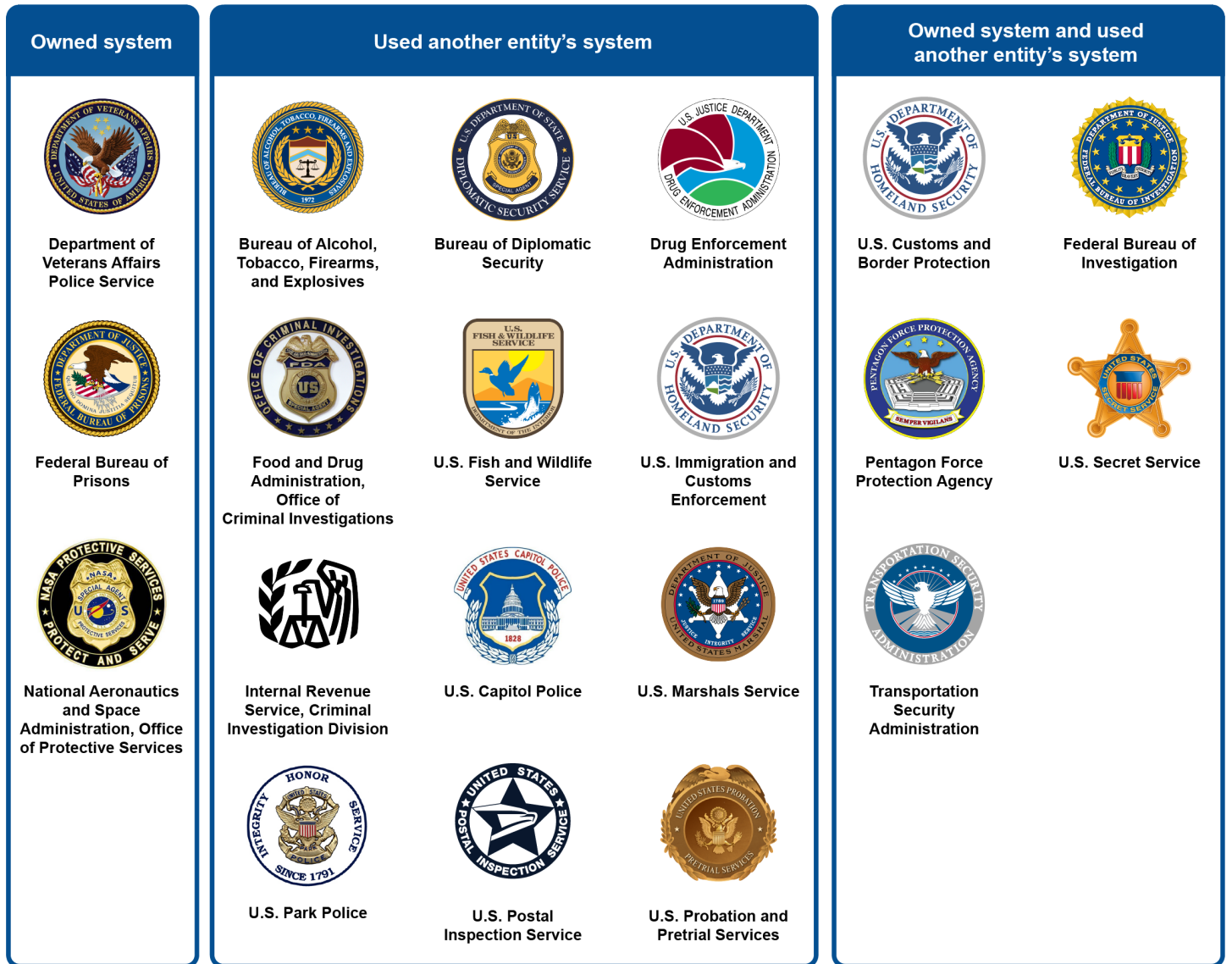
Figure 1: Ownership and Use of Facial Recognition Technology Reported by Federal Agencies that Employ Law Enforcement Officers

Source: GAO analysis of survey data. | GAO-21-105309