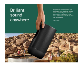
Sonos ad (2019)