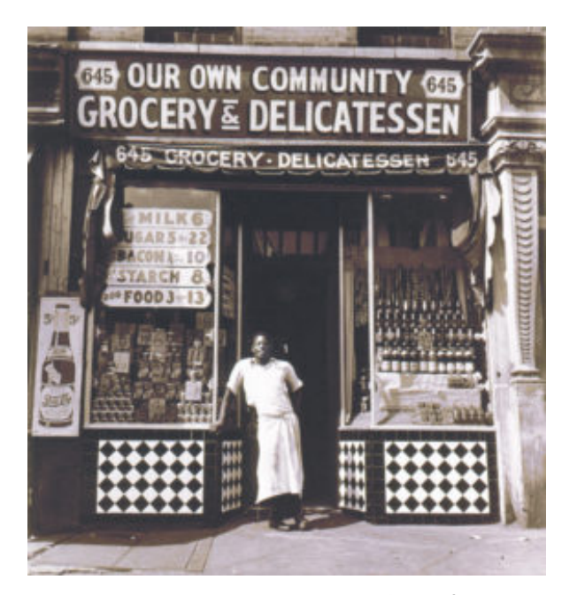
Keeping it in the communi- ty: During the mid-twentieth century, antimonopoly laws, particularly fair trade legislation, contributed to an increase in the number of black-owned, independent businesses like this one in Harlem.

During Reconstruction, the relationship between black political enfranchisement and economic independence gained strength. Abolitionists in Congress passed the Southern Homestead Act, which promised to replace the monopoly of slavery with the creation of a black yeomanry secured with grants of free land. Like General William Tecumseh Sherman's Special Field Order No. 15, with its promise of "forty acres of tillable ground" to newly freed slaves, it fell victim to white backlash and sectional compromise, and was rescinded. Nevertheless, by the 1890s, black Americans who owned or aspired to own their own land joined with independent white farmers in the multiracial Populist Party, in states including Georgia and Texas.