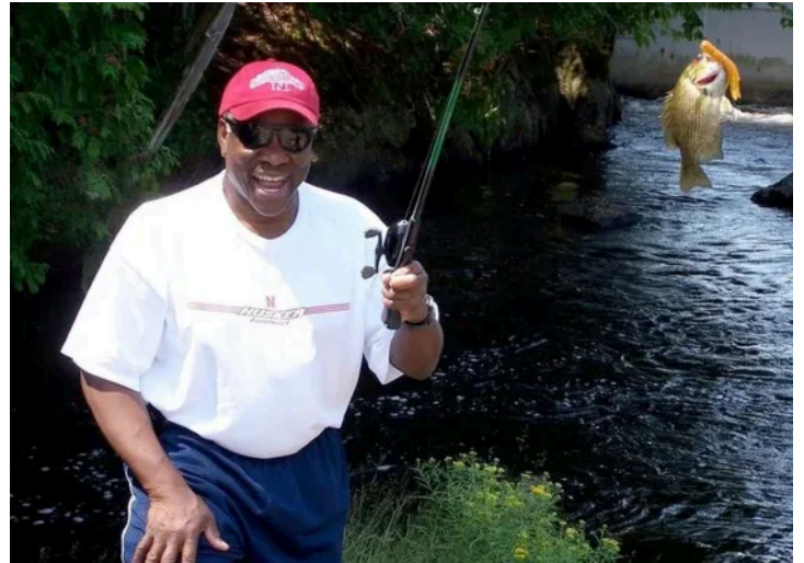
First image: A lodge at Topridge where Thomas has stayed. Second image: Thomas fishing in the Adirondacks.

Crow's access to the justice extends to anyone the businessman chooses to invite along. Thomas' frequent vacations at Topridge have brought him into contact with corporate executives and political activists.