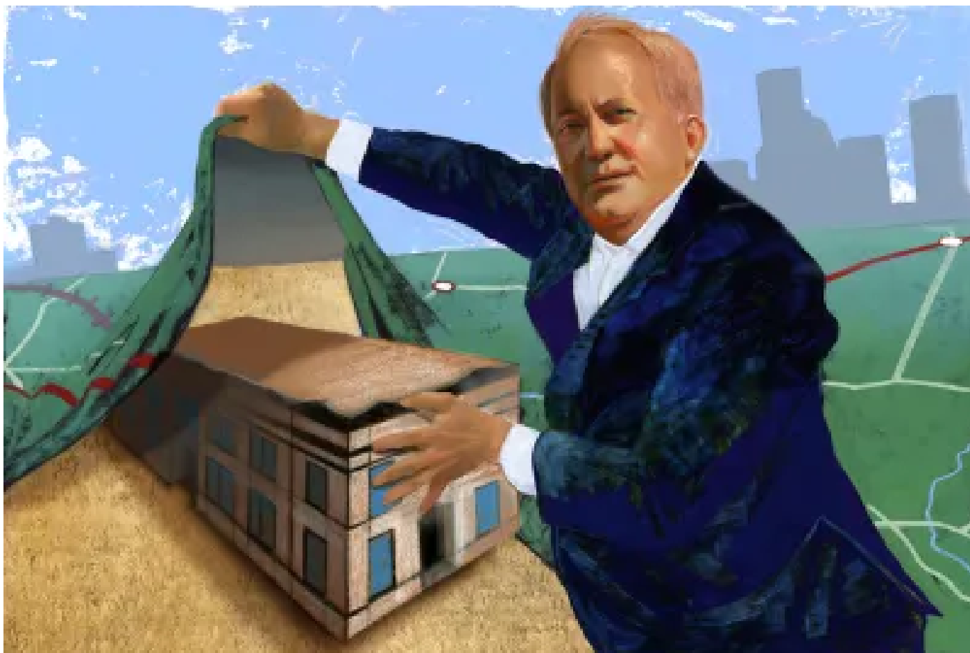
Ken Paxton Wanted to Crack Down on Forum Shopping. Now Lawyers Say He's Improperly Seeking Out Favorable Courts.