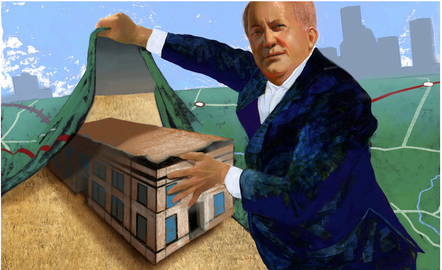
Ken Paxton Wanted to Crack Down on Forum Shopping. Now Lawyers Say He's Improperly Seeking Out Favorable Courts.