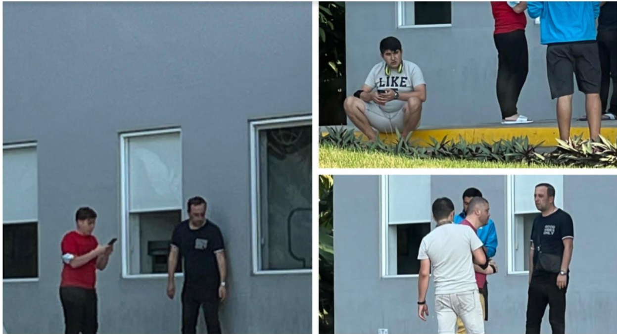
Uzbek migrants in Tapachula, Mexico after crossing from Guatemala on their way to the US southern border. January 2022