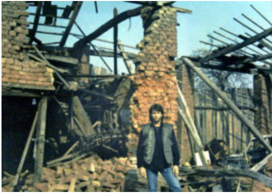
Pakrac, Croatia 1992