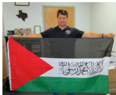
After search warrant execution on suspect