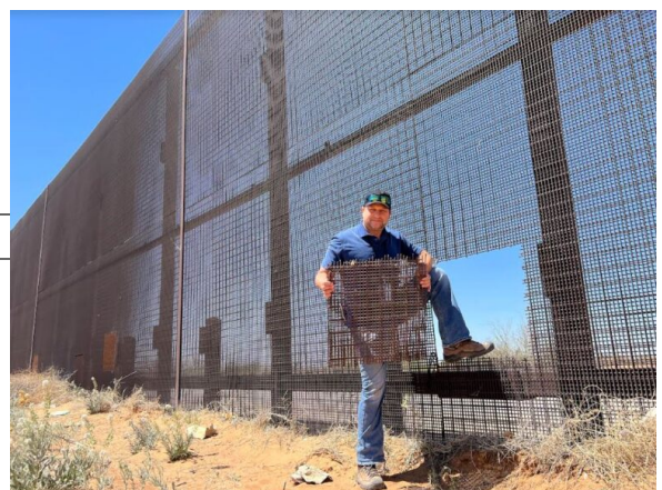
April 2023, west of Juarez, Mexico