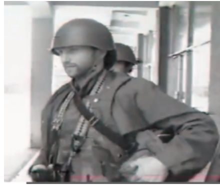
Moldova war 1992