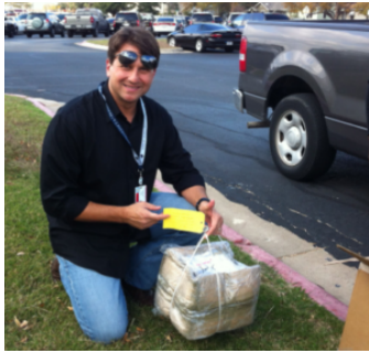
Seizure of Africa drug "khat" in intel op

Until departing in 2018 after nine years, he routinely briefed DPS leadership, elected leaders and members of Congress about domestic and international threats. Holding a DHS security clearance, Bensman worked frequently with FBI Joint Terrorism Task Forces, ICE and its Homeland Security Investigations, the FBI's Terrorist Screening Center, the National Targeting Center, DHS Intelligence & Analysis Division, and the National Counterterrorism Center.